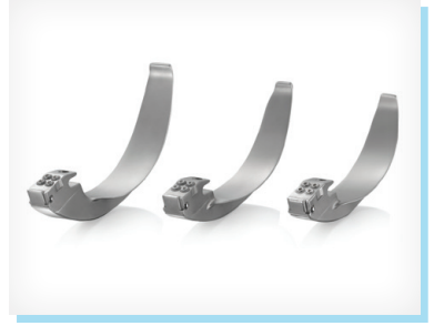
The ClearVue™ VL3R comes standard with size 2, 3, and 4 reusable Mac blades.