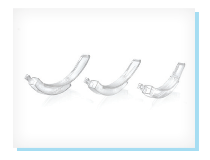
Size 2, 3, and 4 disposable Mac blades are available for the ClearVue™ VL3D.