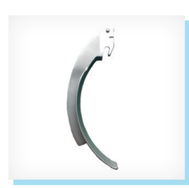
Options blade sizes available are: Miller 0, Miller 1, Mac, 1 and Mac 5.