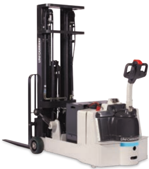
WCX Series Walkie Counterbalance Stackers 24V Load Capacity (lbs): 3,000 / 4,000