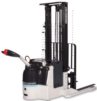
WSX Series Walkie Straddle Stackers 24V Load Capacity (lbs): 3,000 / 4,000