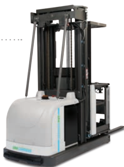
OP Series Order Picker 24V Load Capacity (lbs): 2,200 Ergolift design features secondary mast to ensure pallet is always at the right picking height to eliminate bending and help prevent back strain for increased productivity.