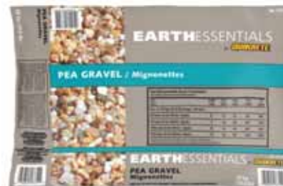
PEA GRAVEL Mfr. No. 137510 Ship Wt. 18 kg bag | 70 bags/pallet