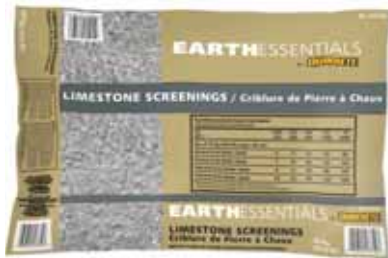
LIMESTONE SCREENINGS Mfr. No. 137546 Ship Wt. 18 kg bag | 70 bags/pallet