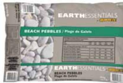
BEACH PEBBLES Mfr. No. 137517 Ship Wt. 18 kg bag | 70 bags/pallet