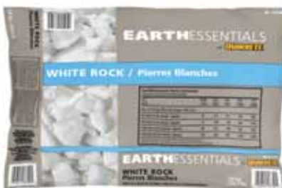
WHITE ROCK Mfr. No. 137504 Ship Wt. 18 kg bag | 70 bags/pallet