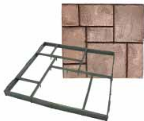
692134 • European Block Pattern