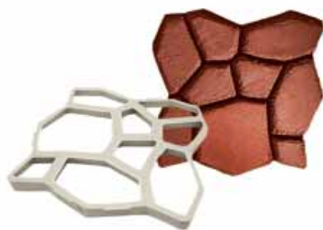
692132 • Country Stone Pattern

Reusable plastic moulds. Fill the mould with concrete mix (approx 1 ½ bags of 25 kg concrete mix fills 1 mould), trowel, and remove the mould. For best results use QUIKRETE® 6000.