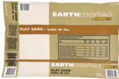
PLAY SAND Mfr. No. 137550 Ship Wt. 18 kg bag | 70 bags/pallet