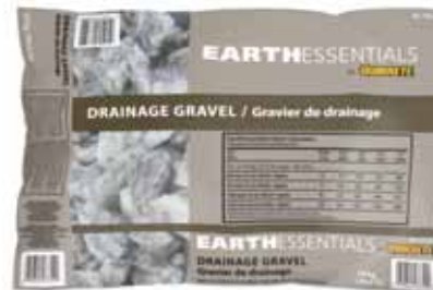
DRAINAGE GRAVEL Mfr. No. 137520 Ship Wt. 18 kg bag | 70 bags/pallet