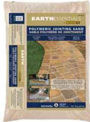
POLYMERIC JOINTING SAND Mfr. No. 137556 Ship Wt. 18 kg bag | 70 bags/pallet