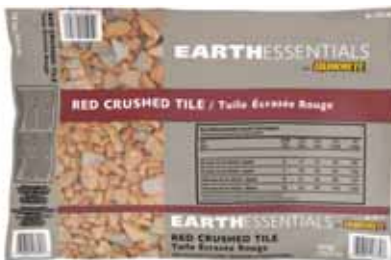
RED CRUSHED TILE Mfr. No. 137530 Ship Wt. 18 kg bag | 70 bags/pallet