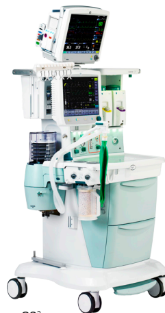
Avance CS 2

Note: Preference for course placement will be given to contract customers. All prices in AUD and exclude GST.