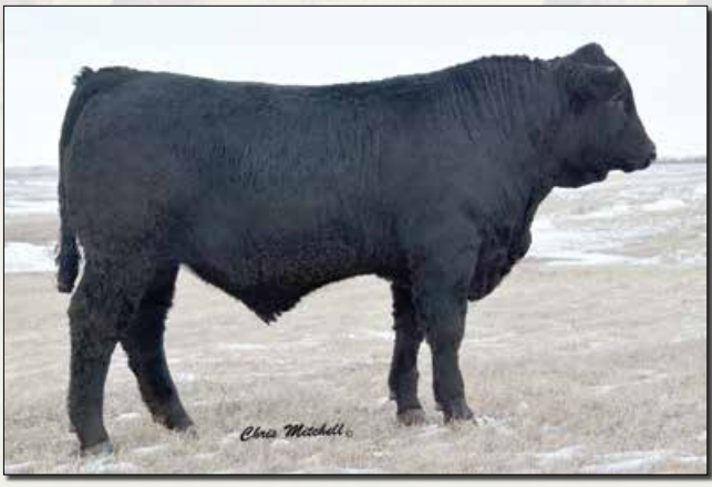
DCHD Golden Buckle Gelv 069B • Sells as Lot 8.