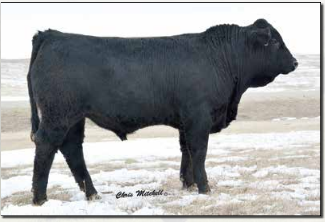
DCHD Golden Buckle Gelv 067B • Sells as Lot 7.