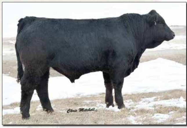
DCHD Golden Buckle Gelv 105B • Sells as Lot 9.