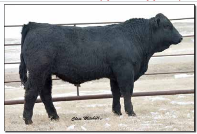
DCHD Golden Buckle Gelv 132B • Sells as Lot 6.