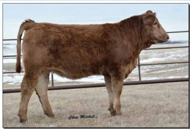
DCHD Golden Buckle Gelv 303B • Sells as Lot 59.