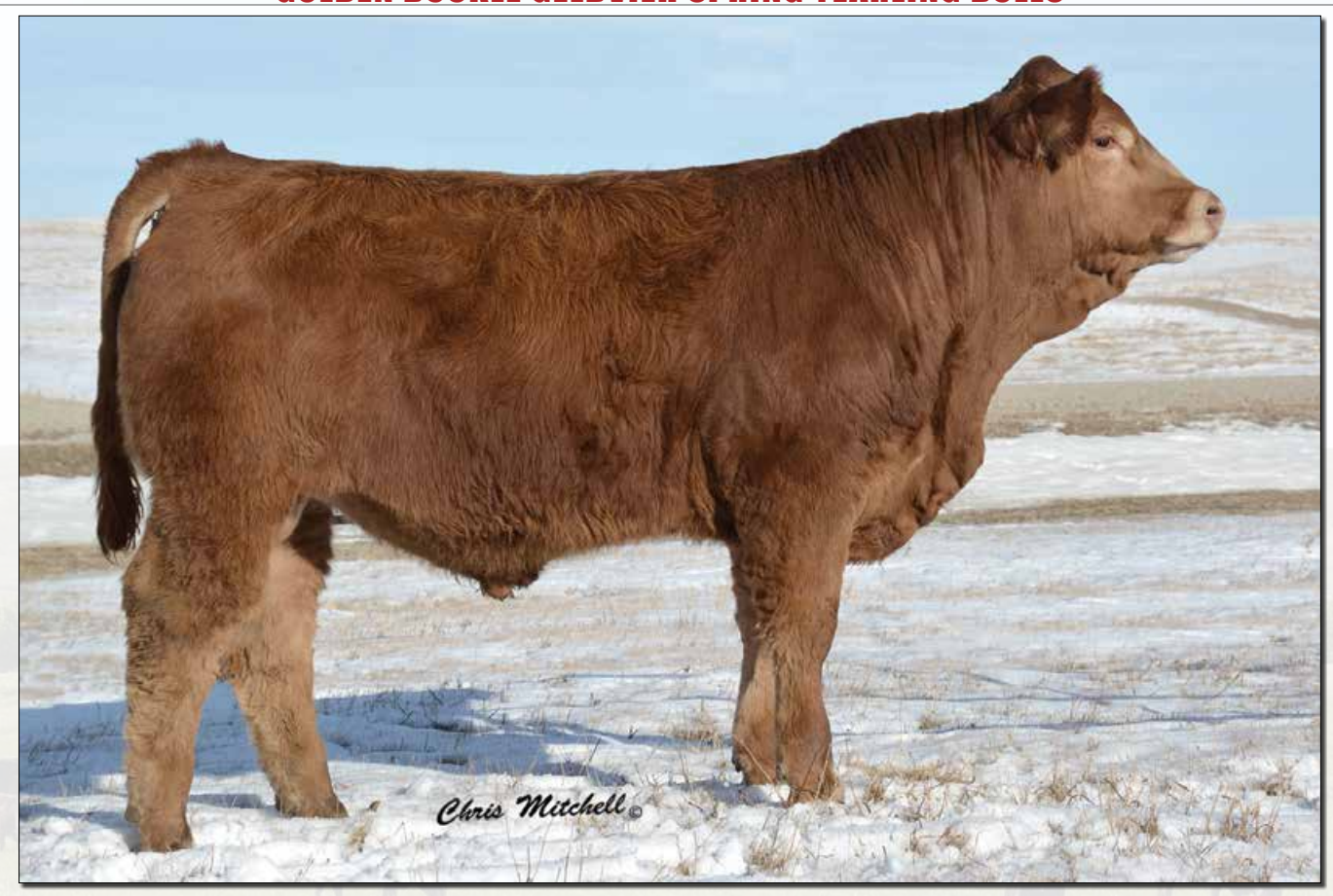
DCHD Golden Buckle Gelv 015B • Sells as Lot 22.