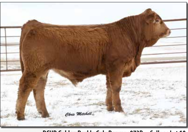
DCHD Golden Buckle Gelv Boomer 073B • Sells as Lot 10.

Homozygous Black, Homozygous Polled, big volume bull out of a top Roy daughter who never misses. He's in the top 10% of the breed for weaning, total maternal, yield grade and the top 15% for yearling weight