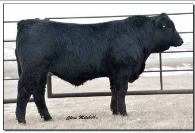
DCHD Golden Buckle Gelv 159B • Sells as Lot 16.