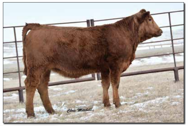
DCHD Golden Buckle Gelv 284B • Sells as Lot 53.

A stylish red heifer out of a productive young Roy daughter. 284B's maternal sister sold in our 2013 sale to Gustin's Diamond D.