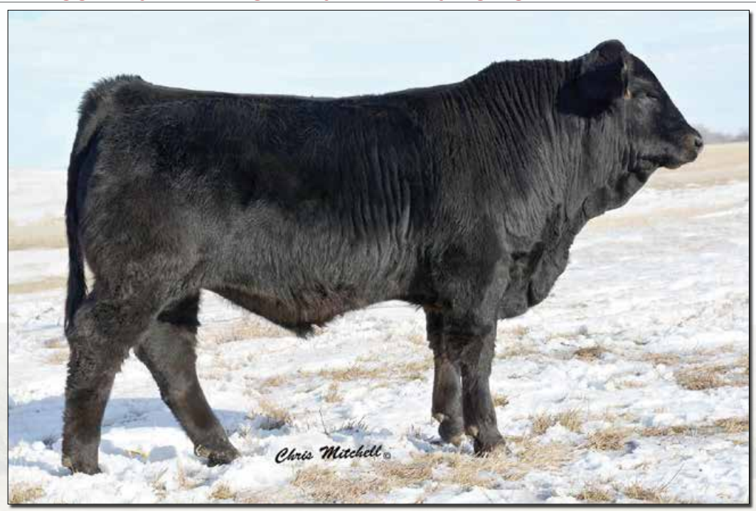
Lot 33 Homozygous Polled, Homozygous Black out of a Dam of Merit cow who never misses. One of the few DCH Y342 bulls for sale this year. This guy is one of our favorites and has been a standout all summer. Check out the depth and width of hip. Dam averaged 105 weaning ratio with 109B ranking in the top 1% of the breed for milk and total maternal-this guy will sire calves with pounds and females who make great replacements.