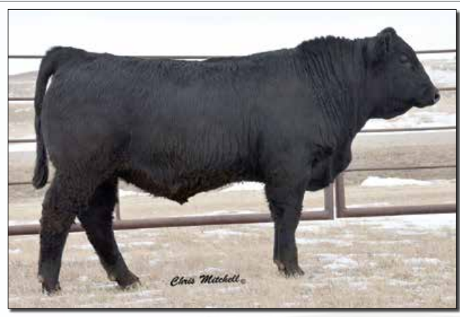
DCHD Golden Buckle Gelv 030B • Sells as Lot 26.