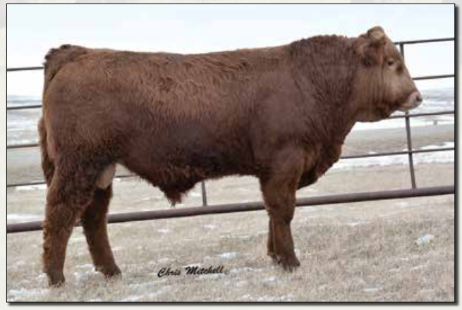
DCHD Golden Buckle Gelv 145B • Sells as Lot 19.

Homozygous Polled bull out of a very productive Roy daughter who has a 111 weaning ratio. 121B ranks in the top 5% of the breed in weaning & yearling weights, and the top 10% for total maternal and carcass weight-a balanced bull from end to end.