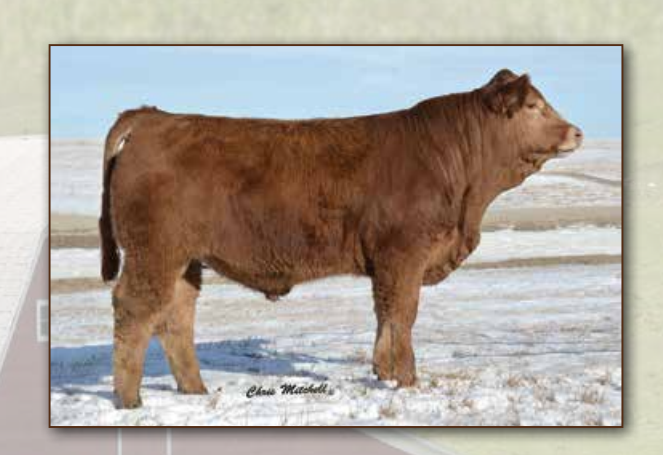
Saturday, February 21, 2015 | 1:00 PM (CST) Napoleon Livestock Auction | Napoleon, North Dakota