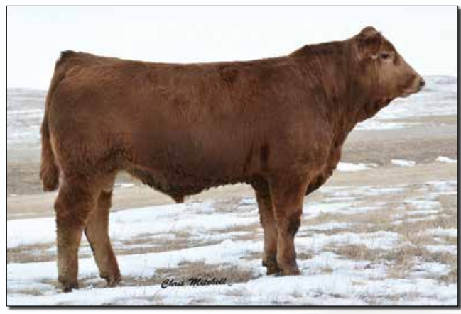
DCHD Golden Buckle Gelv 001B • Sells as Lot 35.