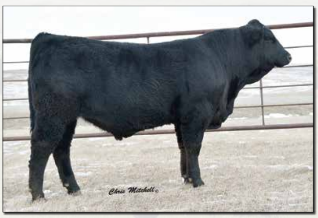
DCHD Golden Buckle Gelv Bubba 042B • Sells as Lot 11.