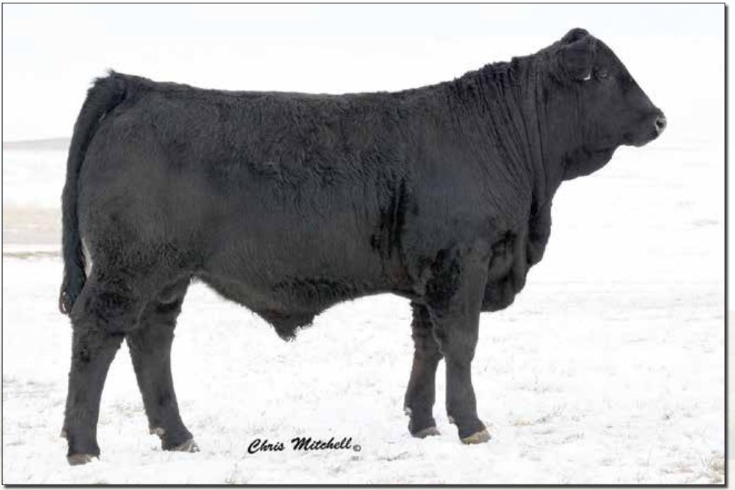
Lot 4 Homozygous Polled super long bull out of a great Roy daughter. 134B had a 110 weaning ratio and ranks in the top 10% of the breed in weaning weight, total maternal and calving ease maternal, top 15% for yearling weight and yield grade. Growth, maternal and a great disposition to boot!