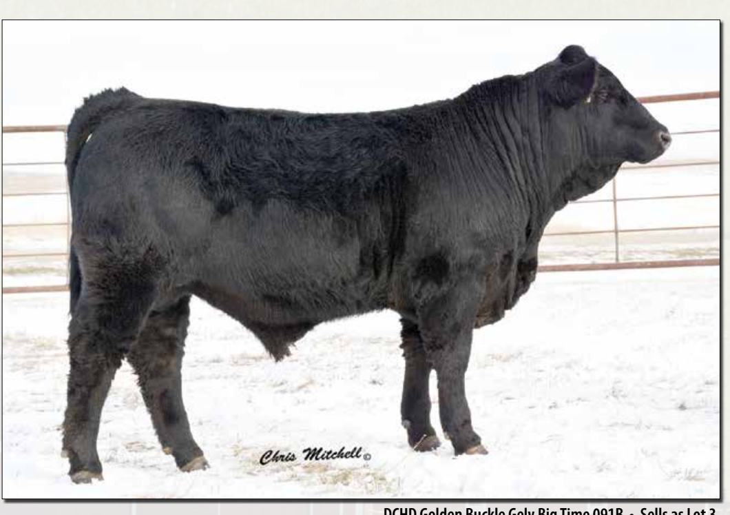
DCHD Golden Buckle Gelv Big Time 091B • Sells as Lot 3.