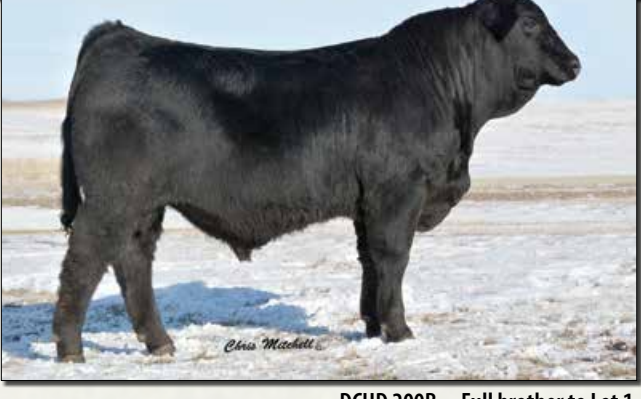
DCHD 200B • Full brother to Lot 1. Sold in 2015 North Dakota Golden Rule Sale.

Homozygous Polled and the top gainer at catalog time with an average of 6.2 pounds/day since weaning. These Carolina Exclusive calves just explode when they hit the feedlot at weaning. We entered a full ET brother, 200B, in this year's Breeder's Choice Futurity and he sold thru the Golden Rule Sale. 200B was sure well received in Denver and made lots of friends and you can see why by looking at this guy. In addition a paternal brother was named the 2015 NWSS Champion Bull. Make sure you look him up on sale day!