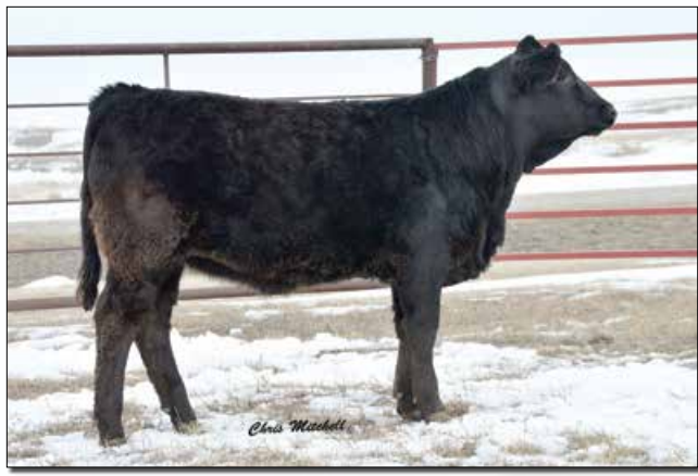
BDOC Brandy 219B • Sells as Lot 47.