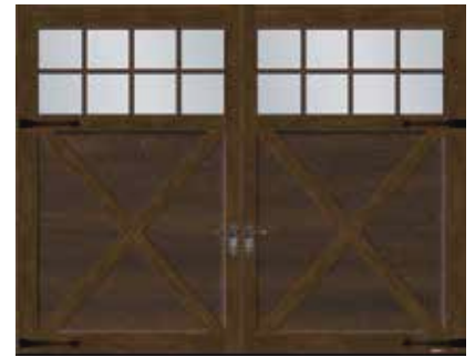
Princeton-Townships Collection All models available in our new rich color: Chocolate Walnut