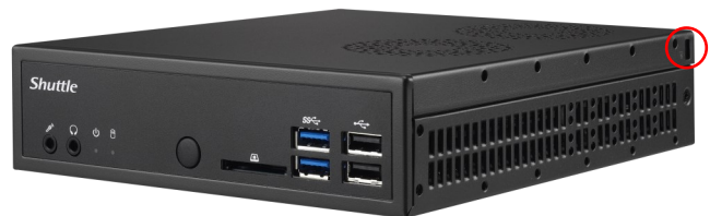
Kensington lock hole on left and right side

For more information on all products, please contact us at sales@us.shuttle.com or 626.820.9000