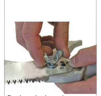
Replace lock washer and wing nut, tighten.

Remove wing nut, lock washer and carriage bolt nut. Place saw blade over bolt and carriage bolt. Replace washer, wing nut and carriage bolt nut.