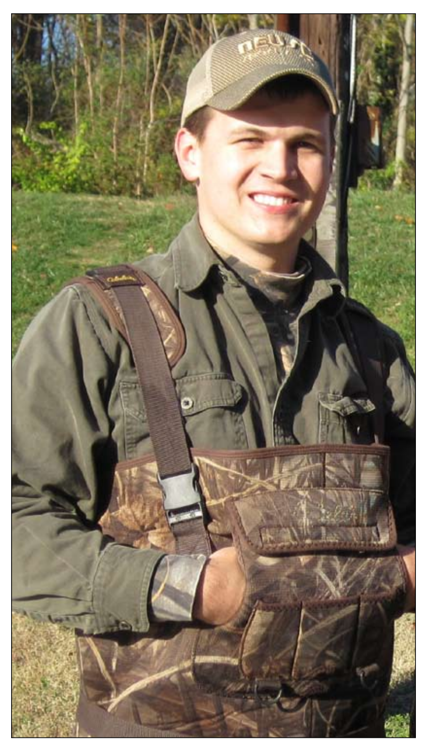
Shannon Bowling studied the influence of landscape composition on northern bobwhite populations.