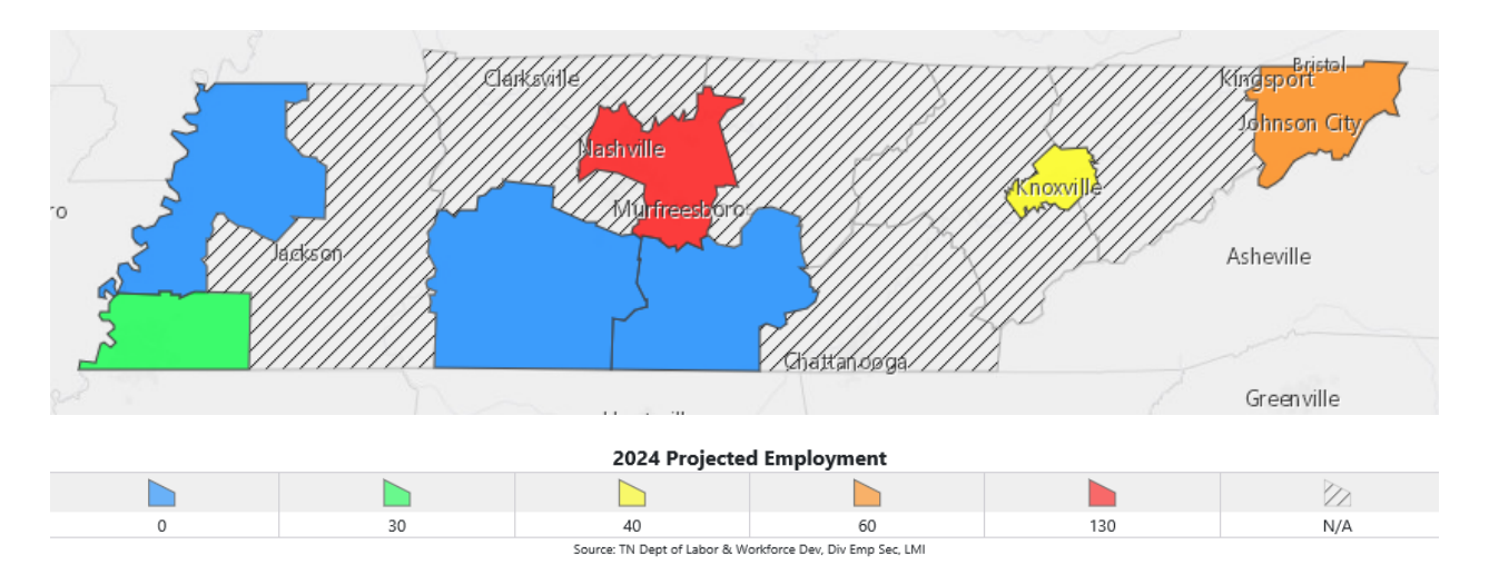
Figure 3. The map below shows the 2024 projected employment for Commercial Pilots in Tennessee by the workforce development regions. <sup>41</sup>

park has been designed for aerospace industry to move into the area.<sup>40</sup> As the industry grows, the need for pilots and air traffic controllers in this area may increase as well.