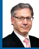
Charles Bernstein Canada