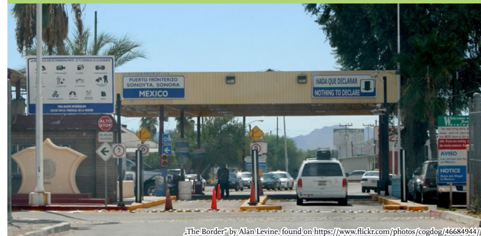
„The Border“