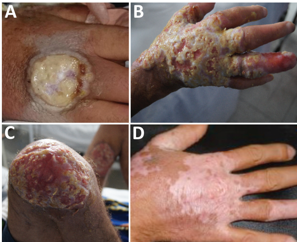
Figure 1. Clinical progression of vaccinia virus infection in a patient with HIV/AIDS, Columbia. A) On December 9, 2014, the patient was referred to the Hospital Universitario Mayor Méderi because of a suppurative ulcer with sharply raised, defined edges on his right hand. B, C) In March 2015, lesions increased in size and disseminated over his face and extremities. D) In July 2015, most lesions completely healed, with mild scarring and depigmentation.

the presence of cytoplasmic B-type inclusion bodies, and the patient reported previous contact with cattle with vesicular lesions in their udders. Therefore, biological samples were remitted to the Instituto Nacional de Salud for viral diagnostics, and, subsequently, to the US Centers for Disease Control and Prevention for confirmation of VACV diagnosis and further characterization.