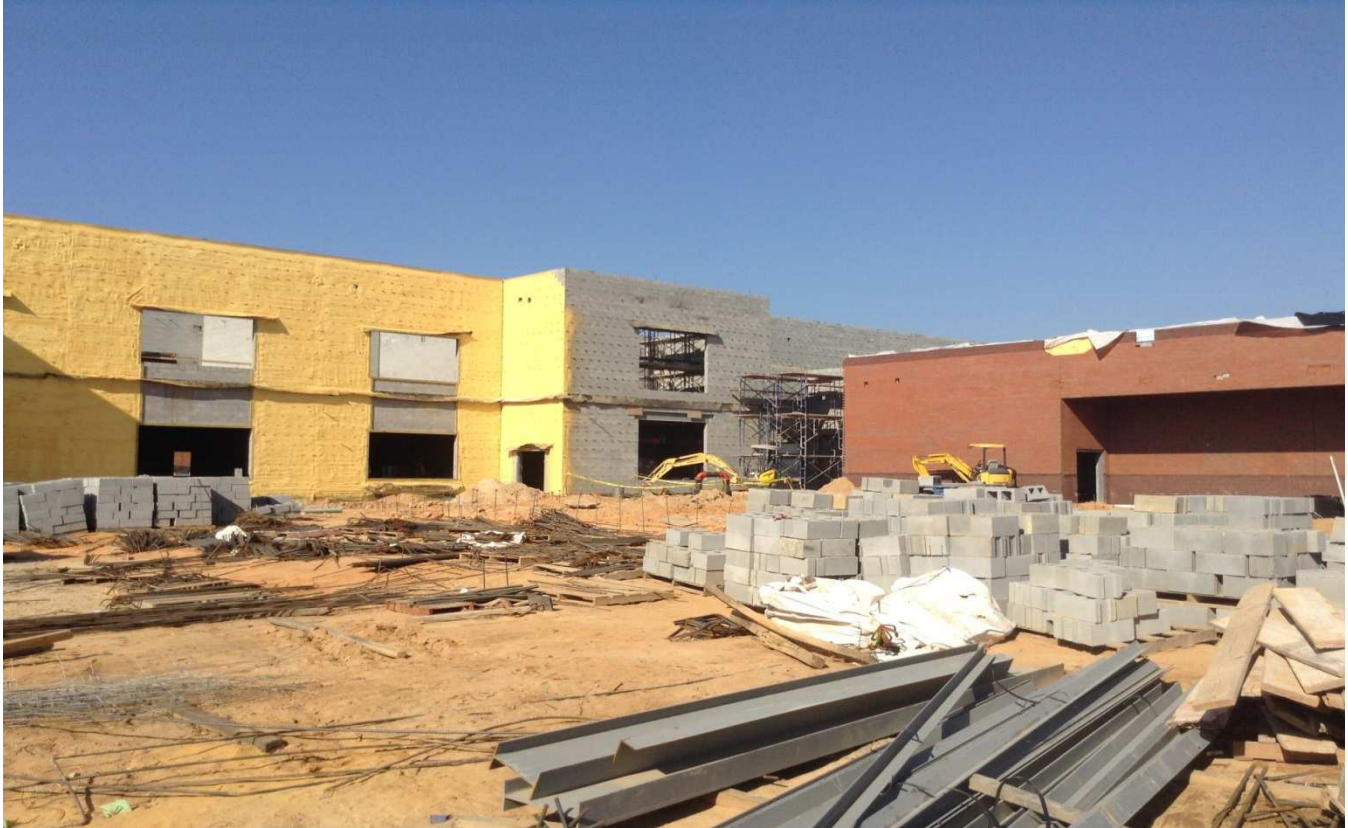
Brick at loading dock elevation and foam spray in progress area B