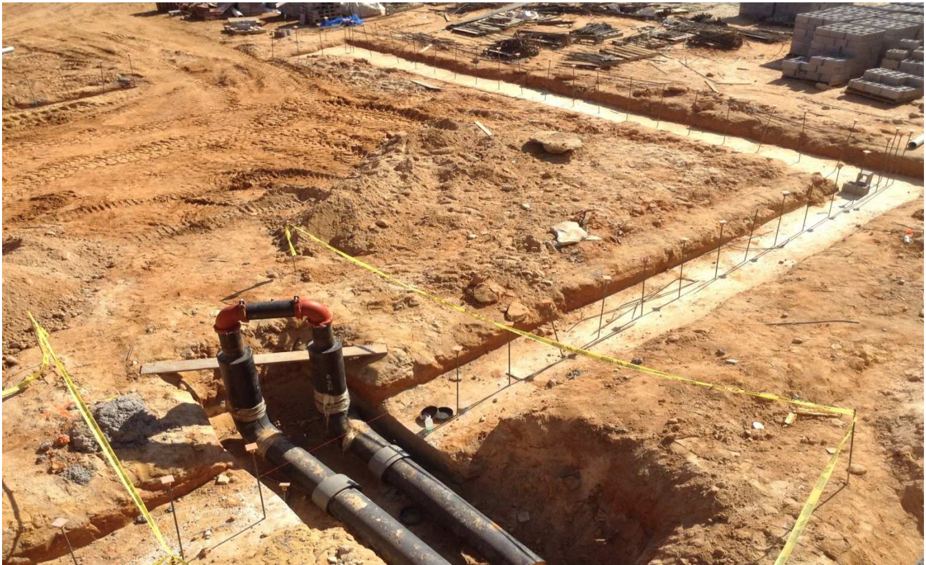
Chiller piping and wall foundations