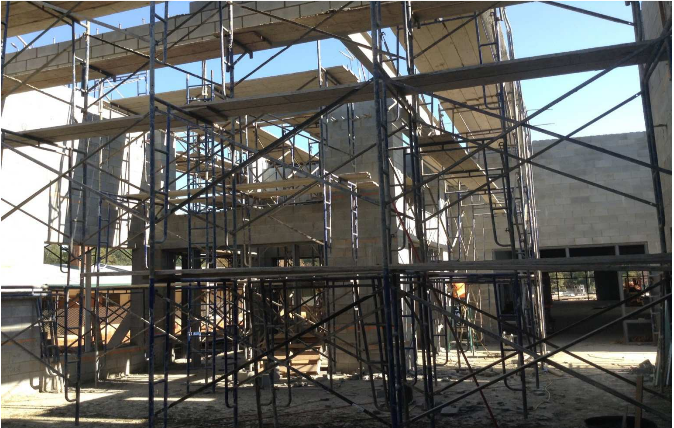
2 nd floor CMU walls area B entrance tower