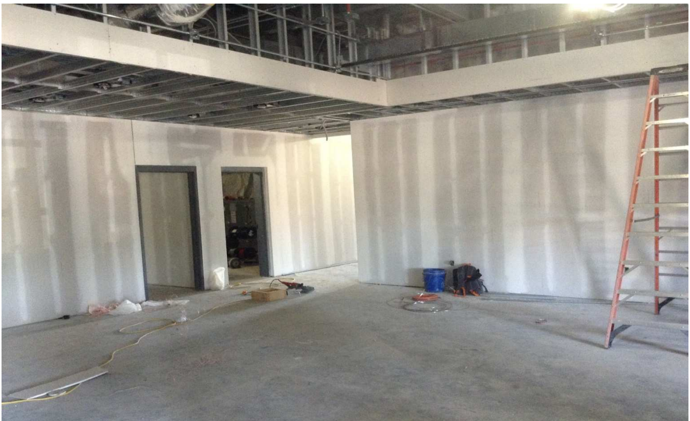
Sheetrock finishing in area E 1 st floor