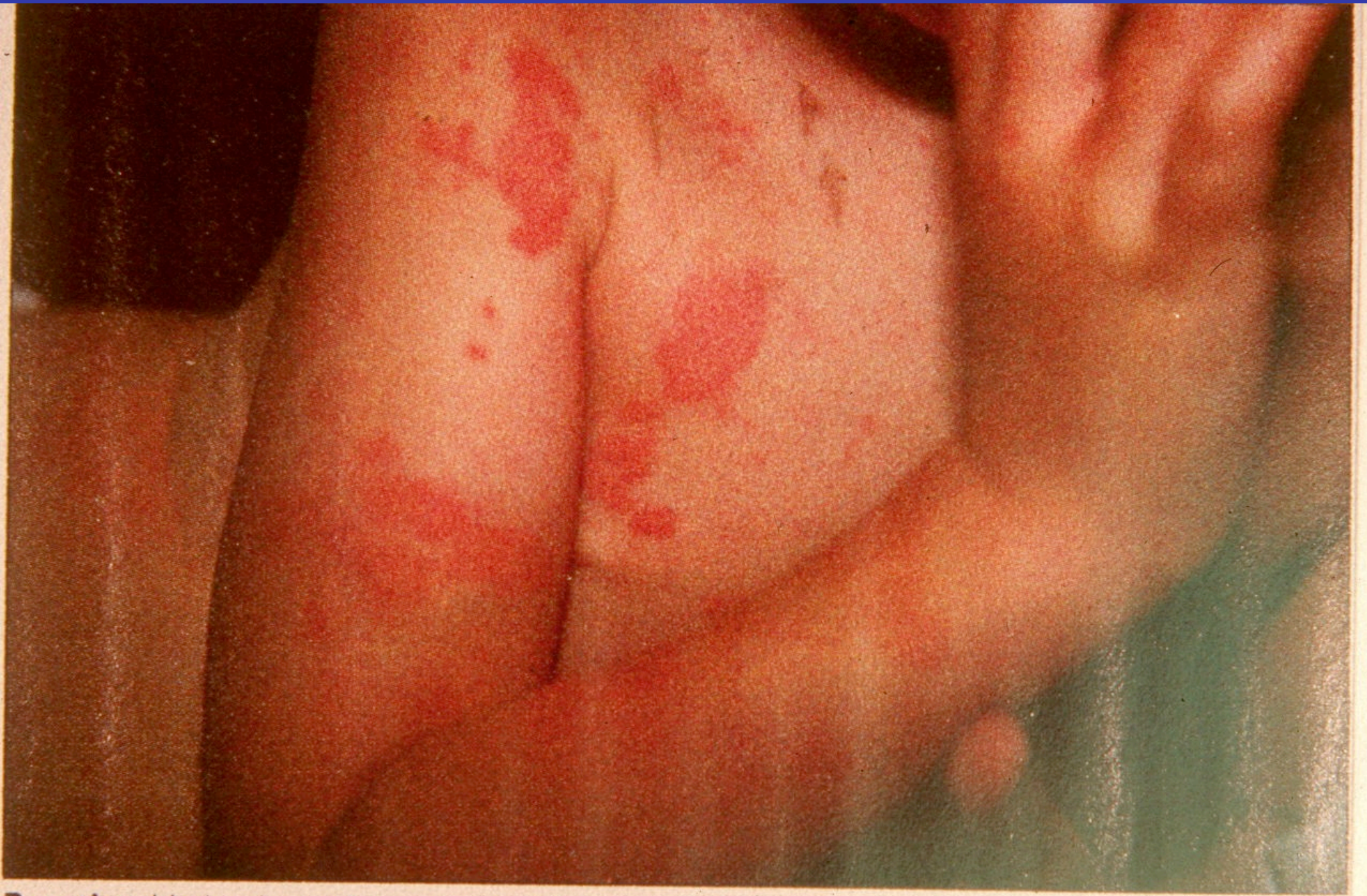
Bee sting. Urticaria, or hives, is the telltale sign of a grade 2 allergic response following a bee sting, shown here, or the sting of any hymenoptera, such as a wasp or ant.