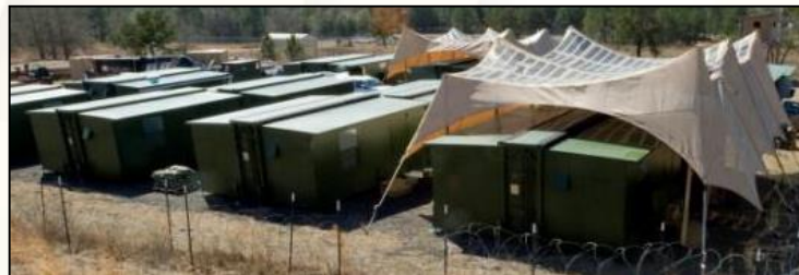
Rigid Wall Shelters