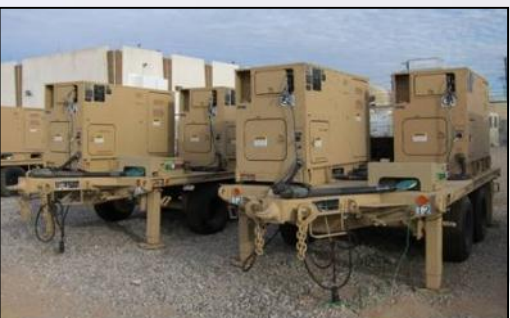
Power Generations Systems