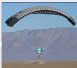
Aerial Delivery Systems