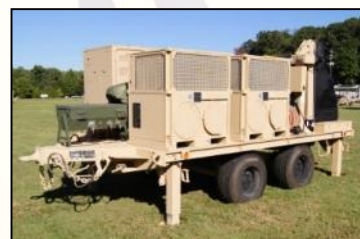
Command Post Support Systems