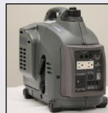
Small Unit & Battery Power