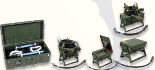
Power Distribution Illumination Systems