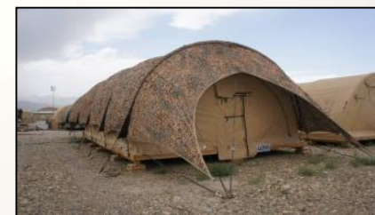
Ultra-Lightweight Camouflage Net System