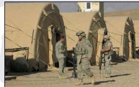
Air Supported Shelters