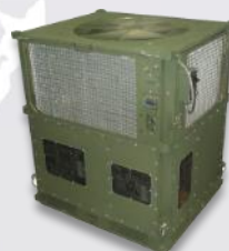
Environmental Control Systems