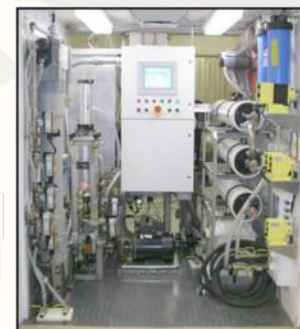
Shower Water Reuse