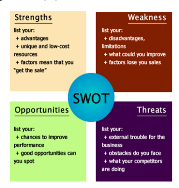
Figure 4: SWOT analysis

• SWOT Analysis: Strengths, weaknesses, opportunities, and threats-SWOT analysis is essentially a directed risk analysis designed to identify risks and opportunities within the greater organizational context. The main difference between this and other analysis techniques is that SWOT reinforces the need to review risks and opportunities from the perspective of the organization as a whole rather than just from inside the project vacuum [11]