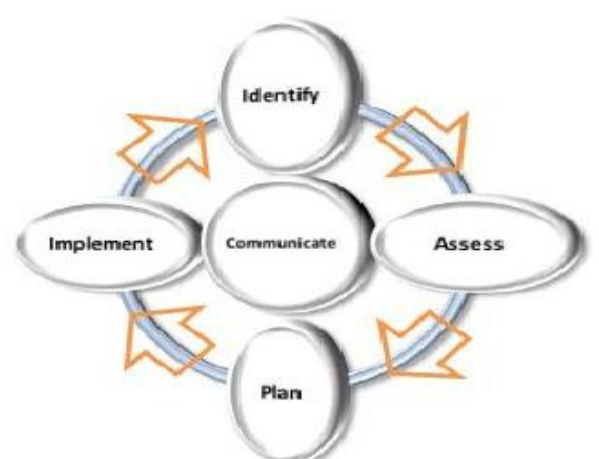
Figure 1: Managing Successful Project with Prince2 TM

The first four stages are sequentially, while the communication should be prepared from the beginning of the project. Therefore, the project manager should establish a good communication network between the project and the relevant stakeholders to achieve the ideal management of projects. Know that each of the above-mentioned stages has its own input and tactics to implement [2].