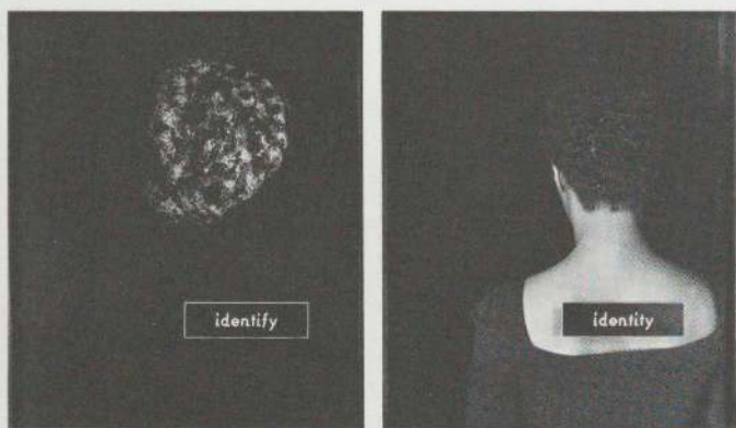
ID. 1990. Two black-and-white silver prints, two plastic plaques; diptych, overall 49" x 7" (122 x 210 cm). Edition of four.