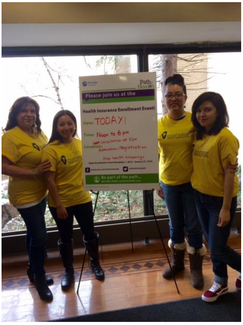
Hispanic Nurses Educating