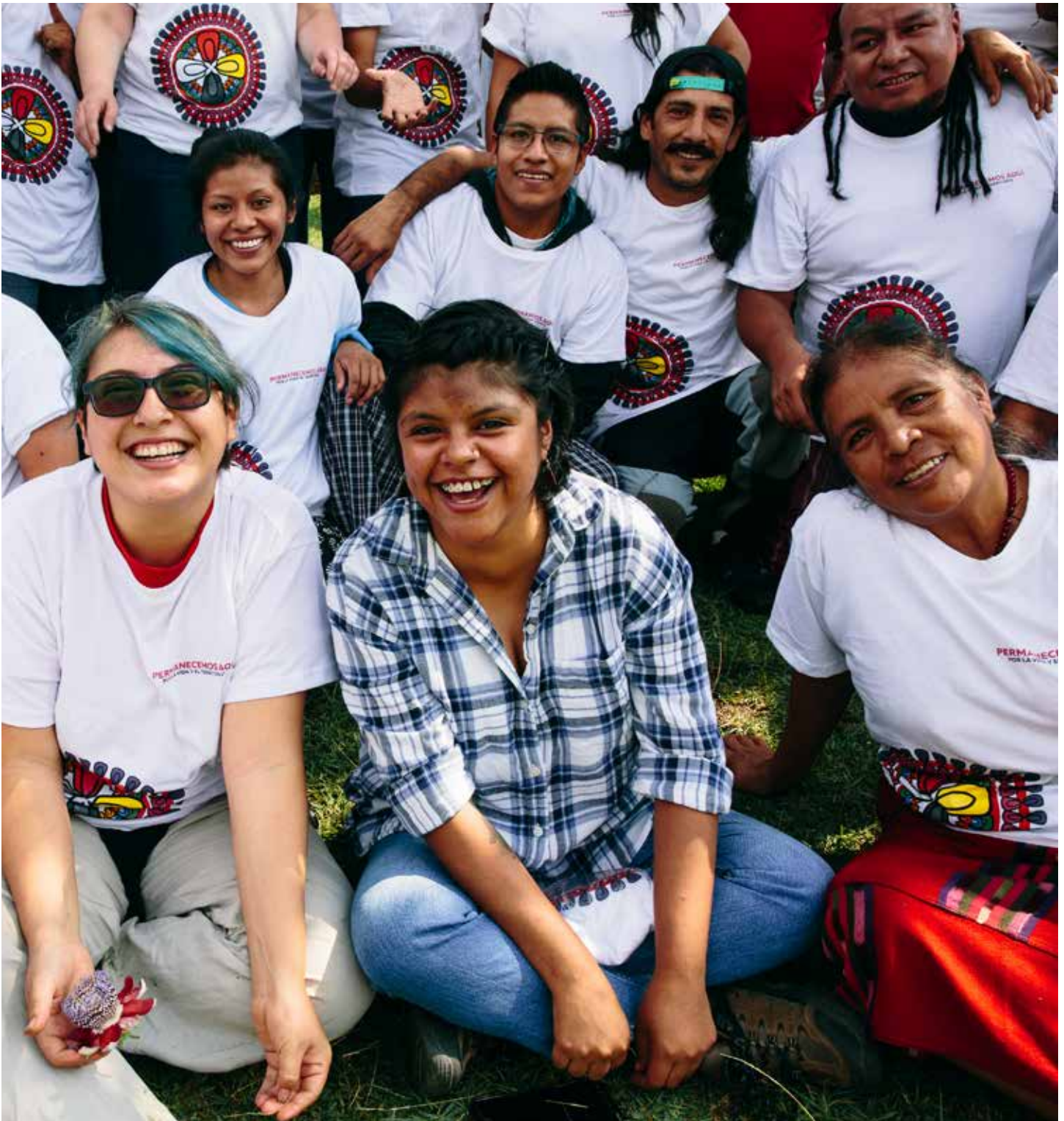
FACING PAGE A leader of the Maya Ixmucañe Women's Counsel (ACMMI) visits the home of one of its members. ABOVE In 2019, AJWS convened 21 Guatemalan grantees for a three-day retreat to strengthen the human rights movement in the country.

Festivales Solidarios is leading an innovative effort to help repair the social fabric of indigenous communities through performance art. The organization uses music, theater, dance, poetry and visual arts to help urban and rural communities heal from the myriad forms of violence inflicted on them—and reclaim their cultural heritage