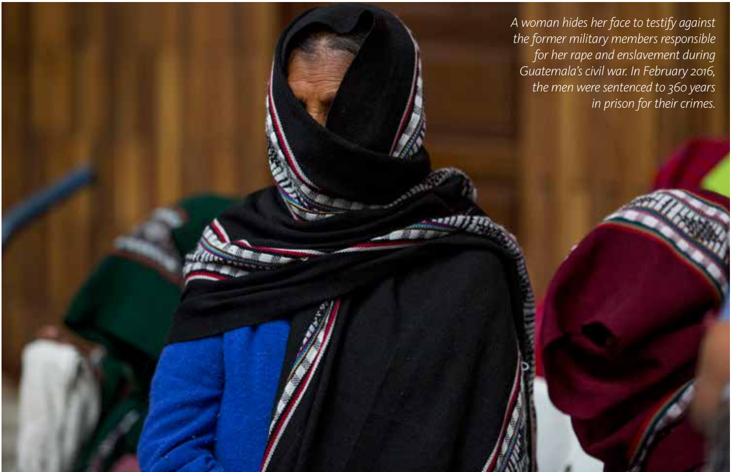
A woman hides her face to testify against the former military members responsible for her rape and enslavement during Guatemala's civil war. In February 2016, the men were sentenced to 360 years in prison for their crimes.

Yet while these court cases bring some measure of closure to those who suffered the brutalities of the war, the people of Guatemala still bear many wounds that even decisive legal victories cannot heal.