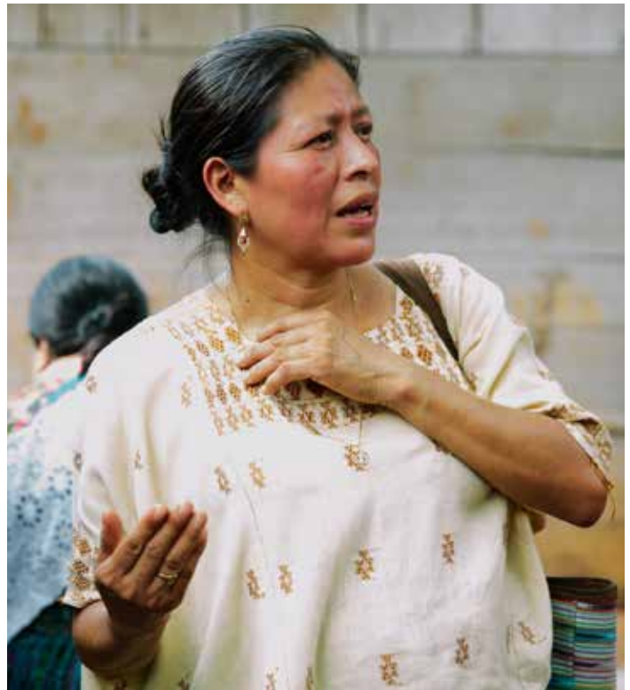
A member of the Maya Ixmucane Women's Counsel (ACMMI), an AJWS grantee that works to promote women's rights, defend indigenous lands, and support survivors of the internal armed conflict.

Transparency International, the global corruption monitoring organization, rates Guatemala among the most corrupt countries in the world, for the prevalence of fraud, bribery and misuse of government funds. The country's leaders were once completely immune to punishment for such crimes; but in recent years, civil society groups and