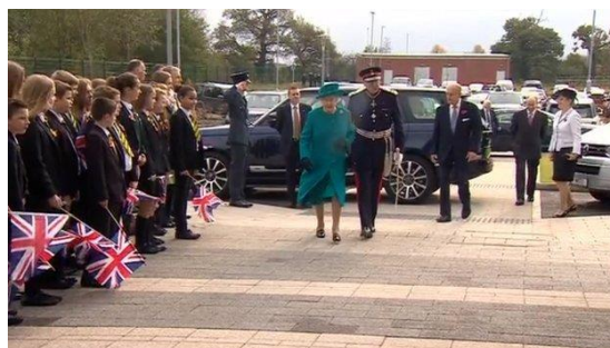
Brewood pupils welcome the Queen to the opening of the new Jaguar Land-Rover Plant