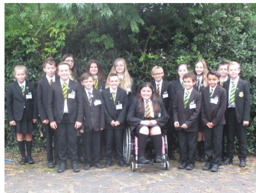
Brewood School Council September 2016

Pupil questionnaires and interviews by staff are also used to gain information of aspects such as homework, marking and feedback and challenge in lessons. Pupils' views are respected, and where possible, comments and suggestions are acted upon. Improvements to our homework and marking policy have been made following pupil feedback.