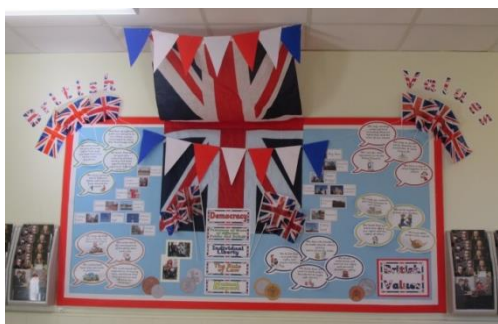
Our British Values 'Ongoing' display.

We have outlined some examples of how we believe we are discussing and developing each value.