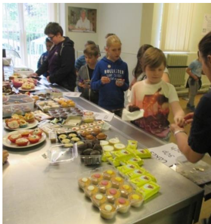
Pupils voted for a cake sale to raise money for the 2015 Nepal Earthquake Appeal.

All are intended to help pupils think of others who need support and to respect the work of agencies across the country and globally who support communities less fortunate than ourselves.