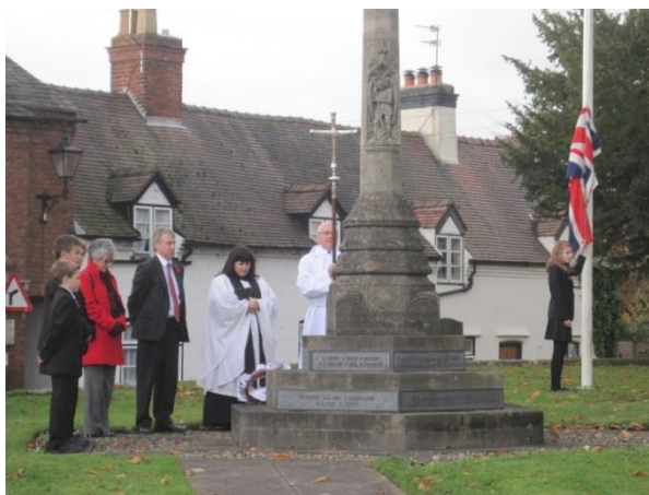
Brewood pupils lay a wreath at the War Memorial in the churchyard of St Mary & St Chads' Church on Remembrance Day.