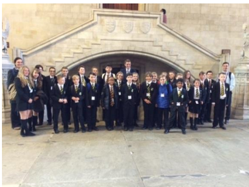
The School Council Visits the House of Commons every year to meet with our MP Gavin Williamson

We outline our expectations of pupils in our 'classroom non-negotiables' and through our behaviour and rewards systems. We help pupils to distinguish right from wrong, to encourage pupils to listen to the views of others even if they are different from their own.