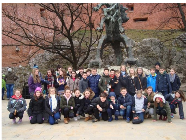
Year 7 and 8 pupils and staff visited Auschwitz in February 2016

Our international visits to France, Germany, Italy, Belgium and Poland over the last three years have widened pupils' knowledge of other people's faiths, beliefs and cultures.