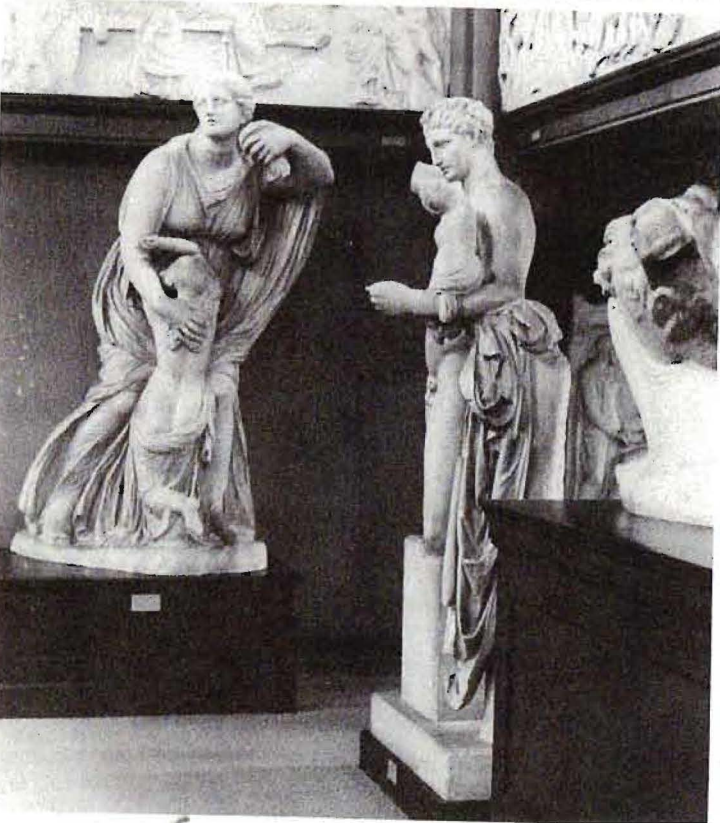
3.7 View, Slater Memorial Museum, Norwich, Connecticut.