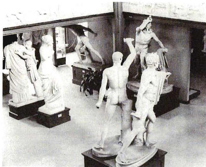
3.5 T. E. Moss, Copywork, Old Boston Museum Interior as Seen in Back Bay , ca. 1895. Museum of Fine Arts, Boston.