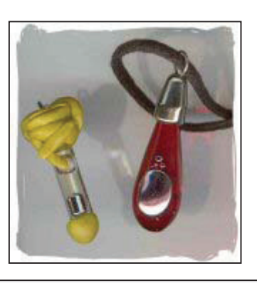
Figure 2. Mercury is put in amulets by Central American spiritualists.

Mercury has been found in Egyptian tombs dating back to 1500 B.C., and it has been used for centuries in medicines. While mercury is no longer sold as a dermal or oral antiseptic, an organic form continues to be used as a vaccine preservative. The ancient Greeks and Romans used mercury in cosmetics and it was also one of the primary cures for syphilis in Europe before modern times. During the medieval period, alchemists thought mercury could be hardened to produce gold. In some cultures, spiritualists associate mercury with mystic qualities and it continues to be used to "bless" homes, cars and apartments. Although its toxic effects are well understood, mercury continues to be used in a wide variety of products and manufacturing processes because it is very useful (Table 1).