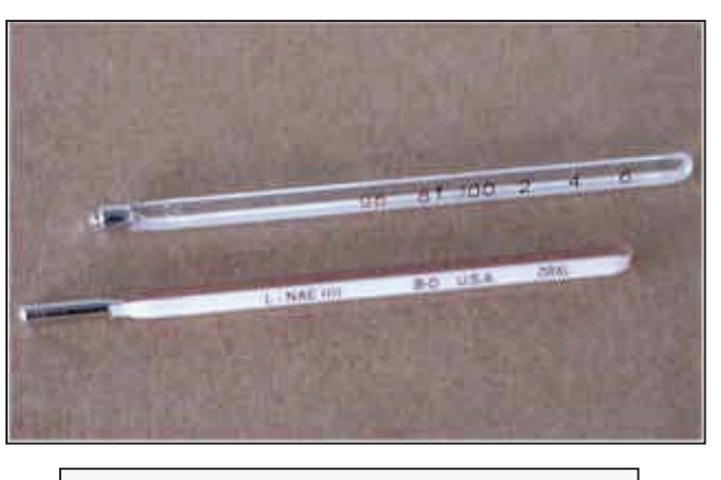
Figure 6. Mercury-containing thermometers.

Mercury-containing products do not pose a health risk as long as they are handled correctly and disposed of safely. If they are broken, liquid mercury will evaporate at room temperature and form mercury vapors. Mercury vapors are colorless and odorless, and inhaling the invisible vapor can lead to serious mercury poisoning. The higher the temperature, the more vapors will be released from liquid metallic mercury. Some people who have breathed mercury vapors report a metallic taste in their mouths. Even a small amount of mercury can lead to health and environmental problems.