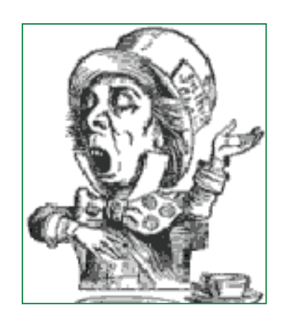
Figure 7. Chronic Mercury Exposure: Mercuric nitrate was used in the hat-making industry up until the 1940s. Hat-makers in Danbury, Connecticut developed a reputation for strange behavior related to their exposure to mercury, and the "Danbury shakes" was a term that referred to the tremors that resulted from mercury poisoning.

www.epa.gov/epaoswer/hazwaste/recycle/electron/crt.htm