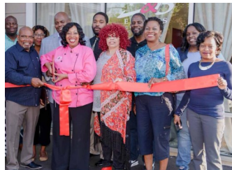
Congratulations to Centennial Member, S&B Event Concepts and Catering on the grand opening of their new location in Collegeville.