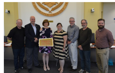
Thank you to Centennial Member, Lansdale Borough , for 40 years of membership and support to The Chamber.