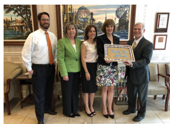
Thank you to Centennial Member, Rubin, Glickman Steinberg & Gifford, P.C. , for 25 years of partnership with The Chamber.