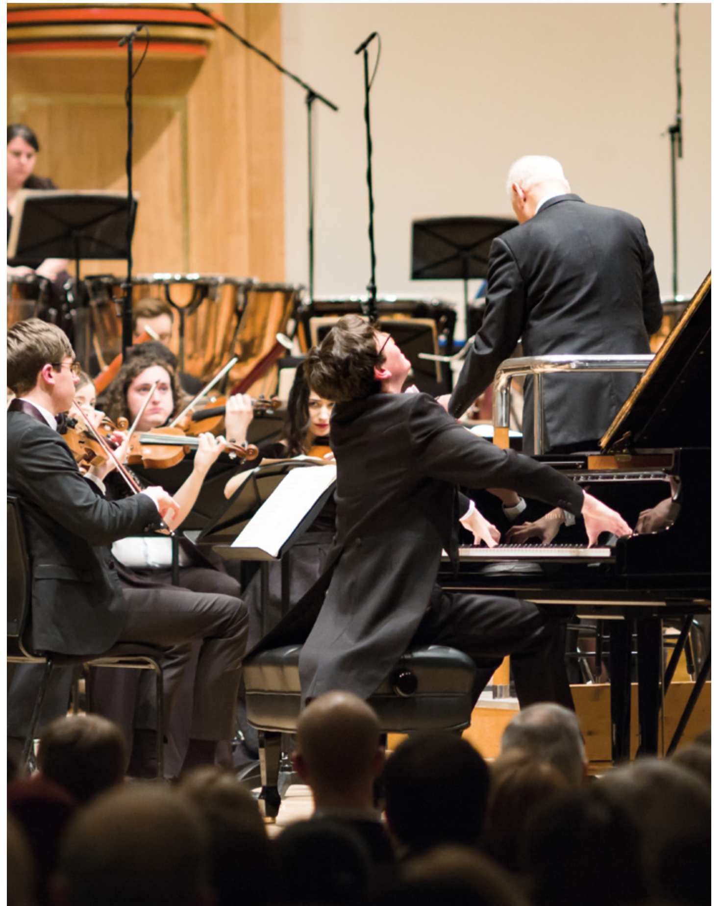
Image right Bernard Haitink conducts the RCM Symphony Orchestra