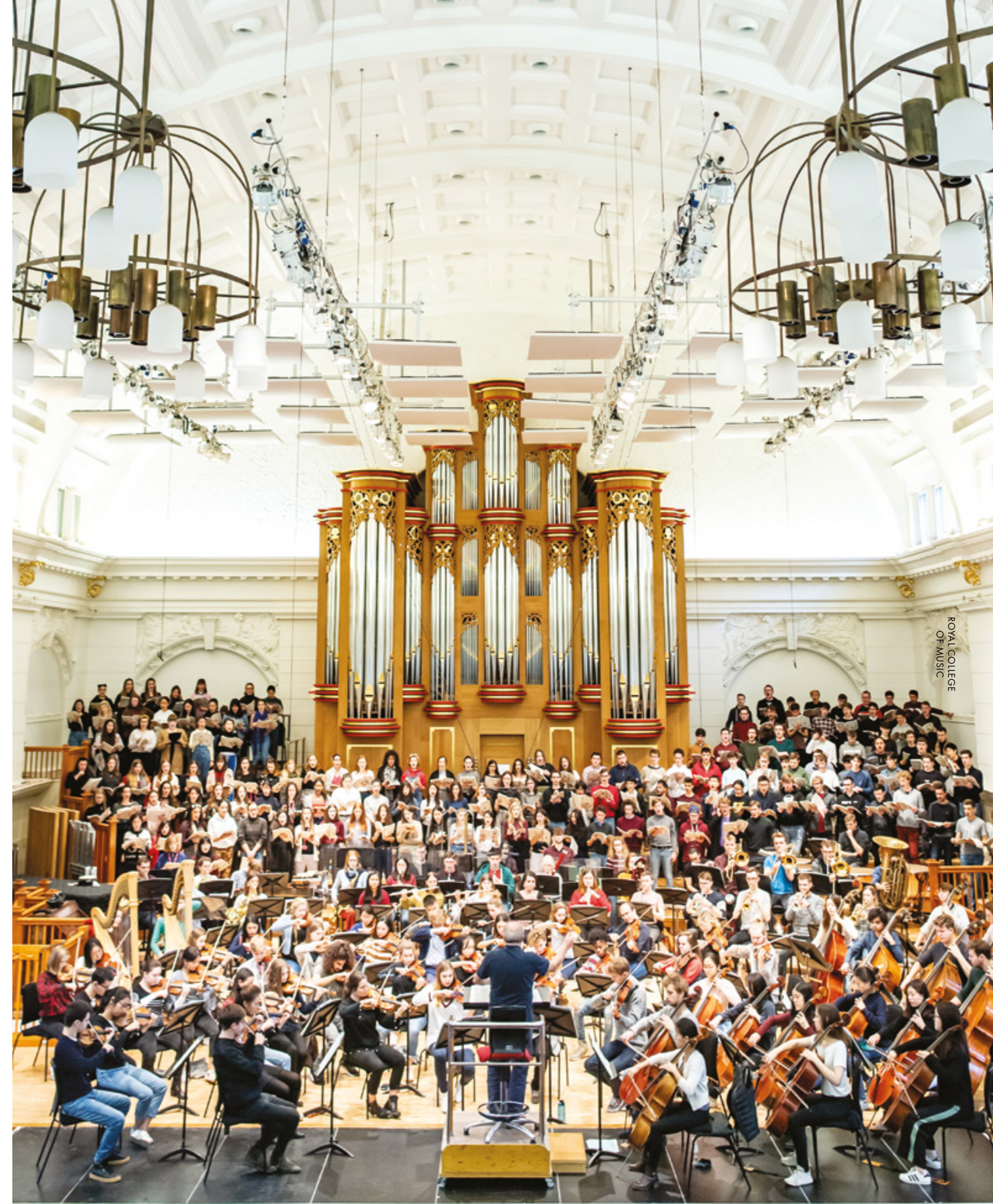
Image RCM Symphony Orchestra and chorus rehearsing with Martyn Brabbins in the Amaryllis Fleming Concert Hall

Our audio, video and composition technology facilities enable performers and composers to work in professional studio conditions. The RCM's studio facilities are used on a range of technology-based courses and modules. Any student can book the studio, with a professional engineer, for a small fee to make recordings and videos for audition submissions, self-promotion and other purposes. Our composition and production suites feature high-spec workstations for tuition and individual project work with a wide range of professional software such as Pro Tools, Logic, Cubase and extensive orchestral sample libraries.