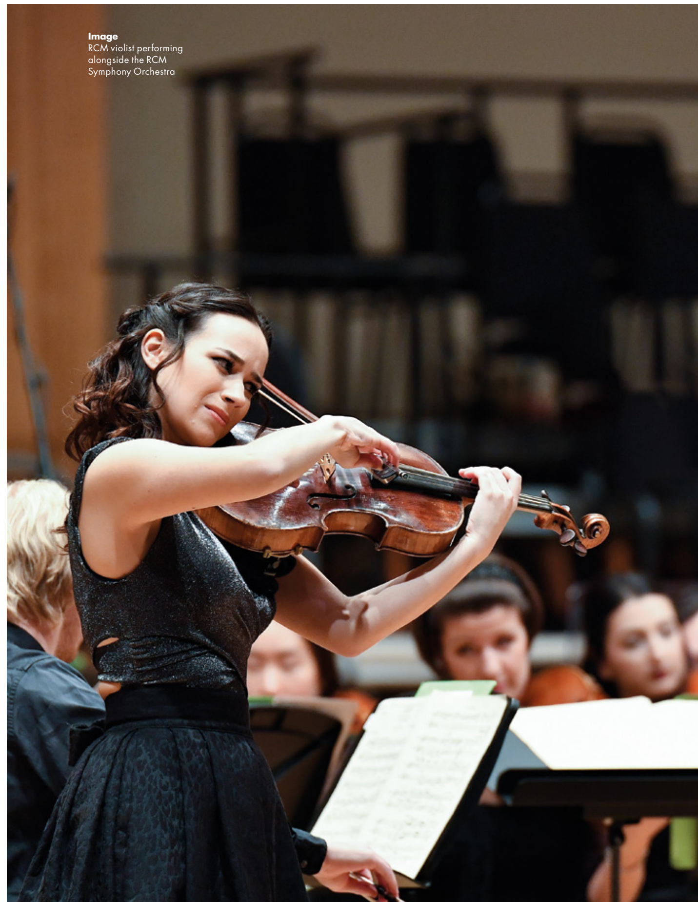
Image RCM violist performing alongside the RCM Symphony Orchestra