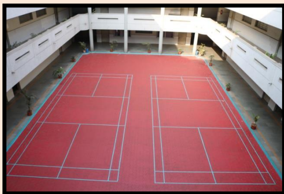
Centre Porch/Badminton Court