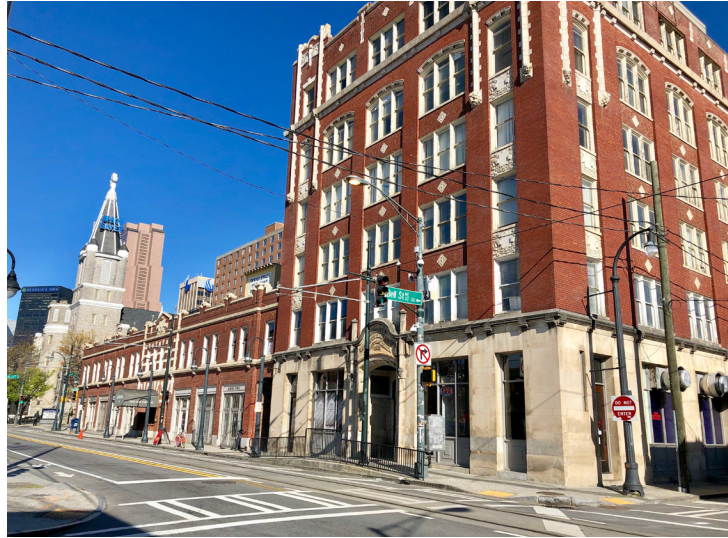
The Oddfellows Building, Atlanta

A historic preservation easement, also called a preservation covenant, is a voluntary legal agreement that can be used to protect the historical, architectural, archaeological, or cultural aspects of historic properties, either permanently or for a number of years. 37 A preservation easement typically prohibits the property owner from demolishing or making alterations that would be inconsistent with the historic character of the property and often requires advanced approval of the easement holder before certain alterations are made. An easement, depending on how it is structured, can also protect against deterioration of the structure by imposing maintenance obligations.