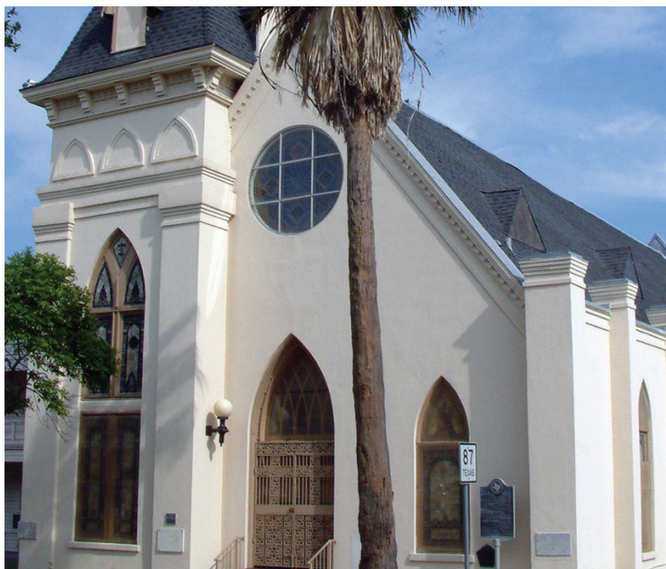
Reedy Chapel AME Church, Galveston

Examples: Examples of historic sites with ties to African American heritage in Texas that are listed on the National Register include the Reedy Chapel-AME Church in Galveston, Freedmen’s Town Historic District in Houston, the Allen Chapel African Methodist Episcopal Church in Fort Worth, the Juanita J. Craft Civil Rights House in Dallas, the Booker T. Washington Emancipation Proclamation Park in Mexia, the Hopewell-Rosenwald School in Bastrop County, and the 10th Street Historic District in Dallas.