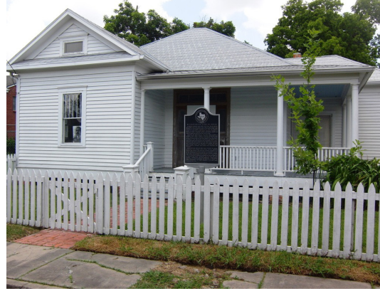
Rutherford B. H. Yates House, Houston

Examples: Local historic landmark sites with ties to African American heritage include: Rutherford B. H. Yates House in Houston, Juanita Craft House in Dallas, Connelly-Yerwood House in Austin, Old African American Baptist Church in San Marcos, and Mt. Olive Missionary Baptist Church in Galveston.