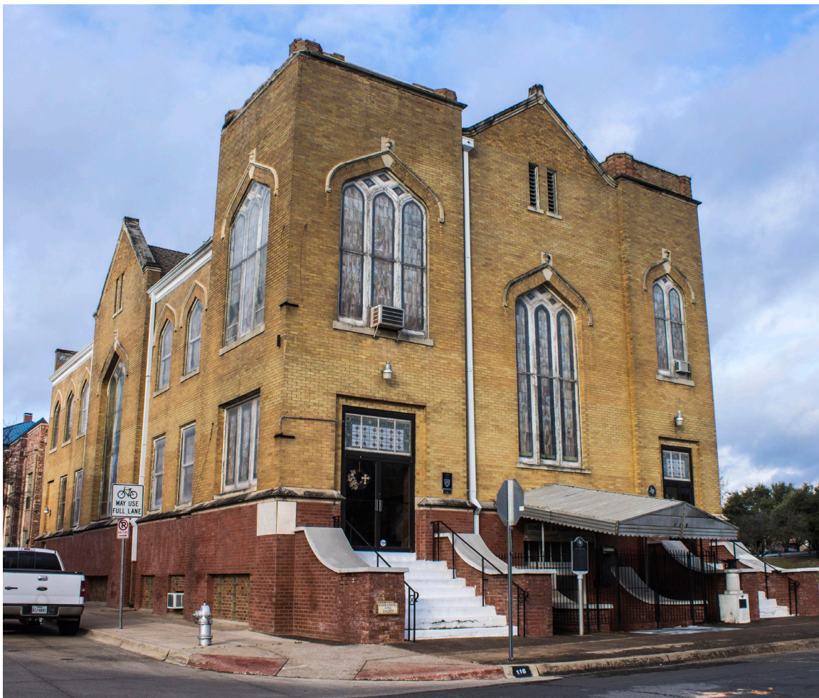
Allen Chapel AME Church in Fort Worth, TX

An electronic copy of this toolkit is available at law.utexas.edu/clinics/ecdc/publications/#historic . We welcome suggestions for updates to the toolkit! Contact us at ecdc@law.utexas.edu .