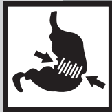
tightness in stomach