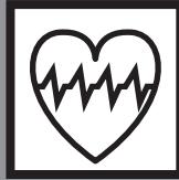
rapid heartbeat & breathing