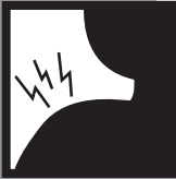
neck and shoulder pain