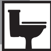
changes in bowels