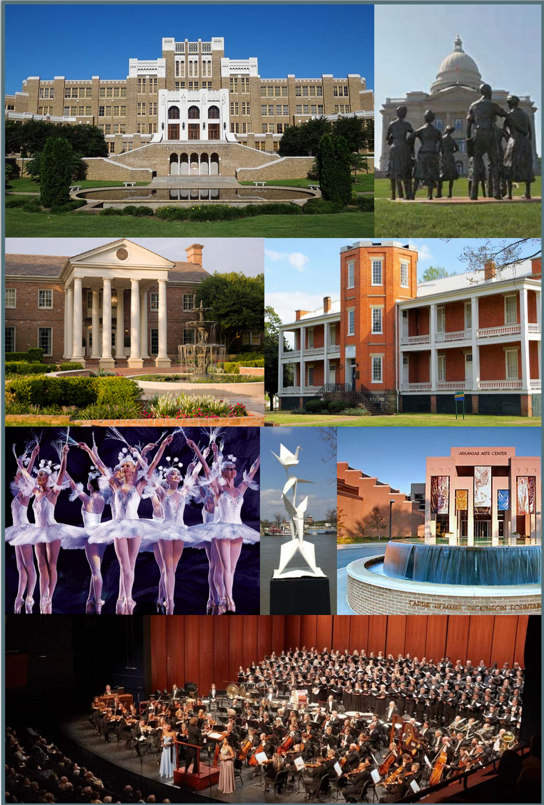
Central Arkansas is rich in History and Culture...