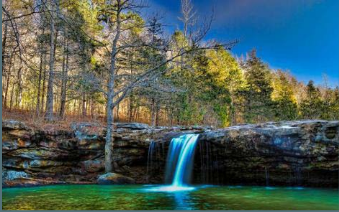
...includes some of the very best of the Great Outdoors