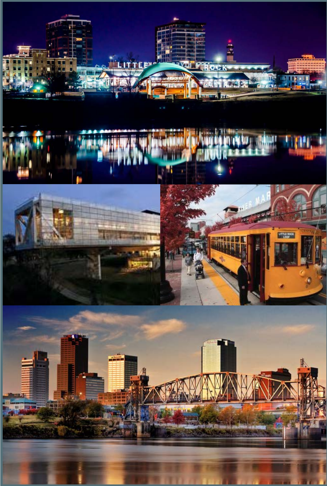
Is home to a vibrant and growing Metropolitan Area...