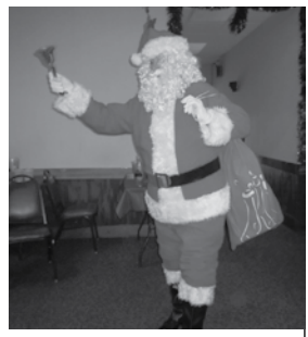
To view more pictures of the party, go to the Pulaski Association site at: http://nypdpulaski.org/Home_Page.html.

Many thanks to Santa and his Pulaski elves who made this event possible!