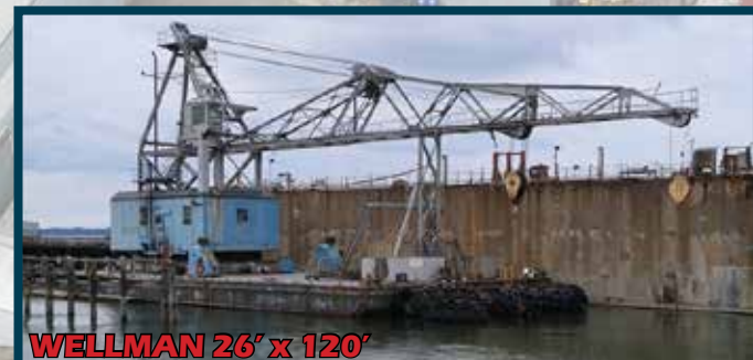
WELLMAN 26' x 120'