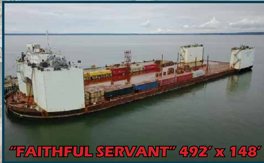
"FAITHFUL SERVANT" 492' x 148'