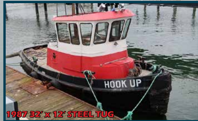
1987 32' x 12' STEEL TUG