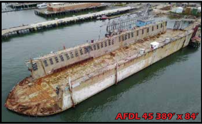
AFDL 45 389' x 84'