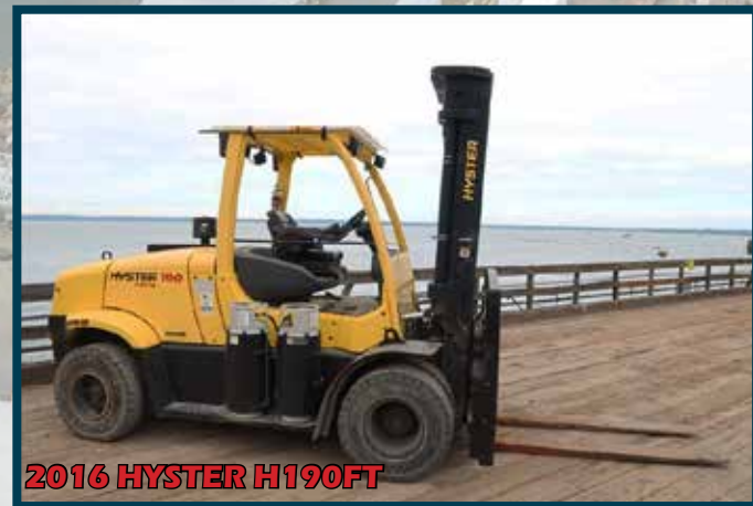
2016 HYSTER H190FT