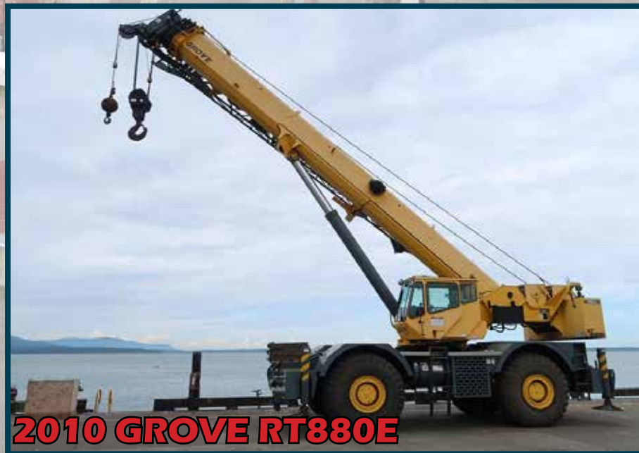
2010 GROVE RT880E