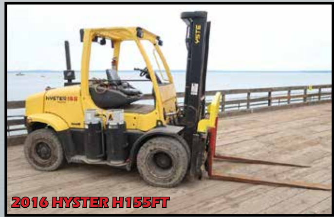
2016 HYSTER H155FT