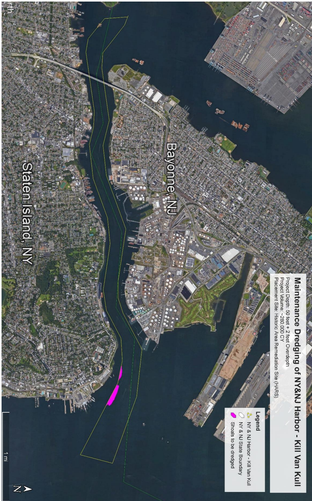
Figure 1: Proposed Dredging Area in the New York and New Jersey Harbor – Kill Van Kill