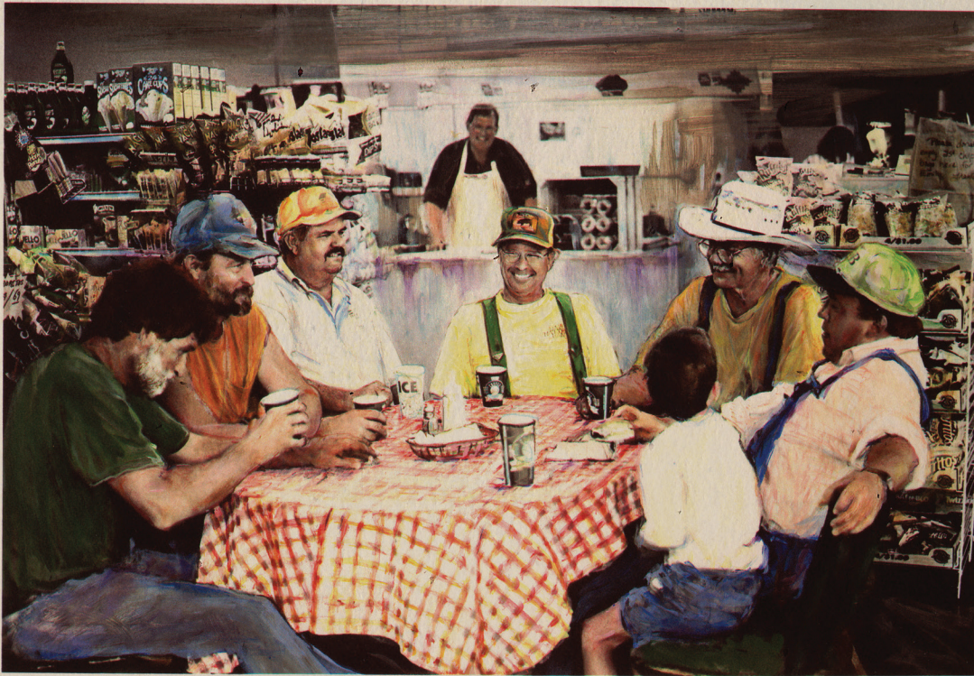
Table of Wisdom