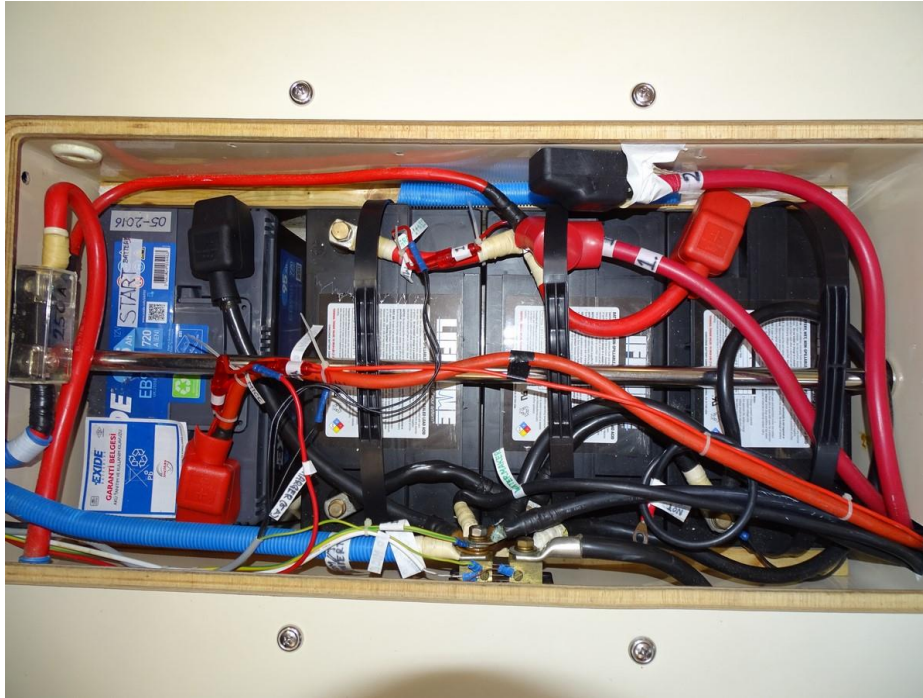
Part of the battery compartment.

Comments: 1. 7x 100 Ah AGM flat plate deep cycle batteries, 1x Exide 95 Ah engine start. All batteries are closed type and well secured. 2. Four 100 W solar panels to A-Frame with MPPT charge controller.