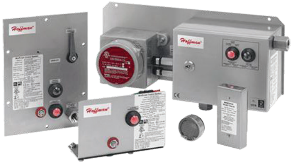
Purge and Pressurization Systems

Pressurization is the process of creating a higher internal pressure that is provided by a protective gas supply, preventing any hazardous gas or dust from entering the enclosure. Any penetrations or leak areas will have protective gas exiting the enclosure rather than hazardous gas or dust migrating into it. This segregates any external explosive or hazardous material from the energized internal equipment. NFPA requires a minimum pressure of 0.1 inches of water column (25Pa) for Class I and II applications