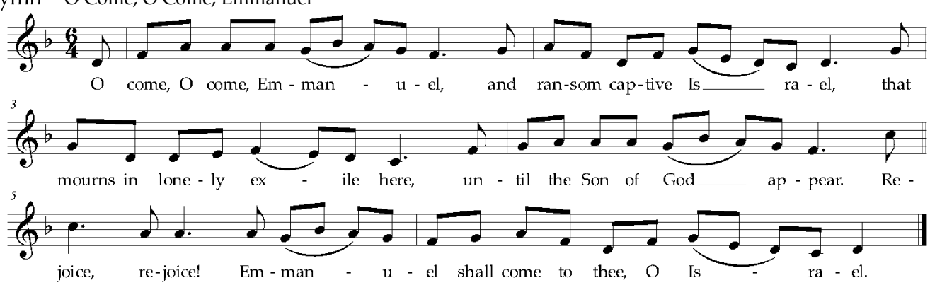
Traditional carol from the 9th century