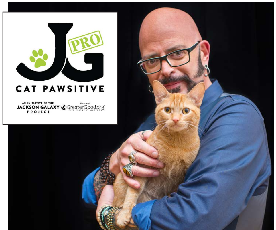
Jackson Galaxy, cat behaviorist and founder of the Cat Pawsitive Pro Program.