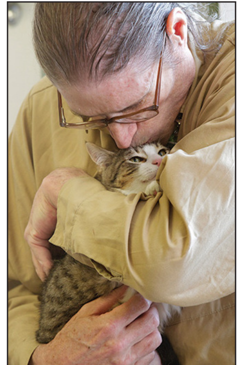
An inmate in the "Monroe Corrections Kitten Connections" foster program.

According to the founder of this exciting program, Jackson Galaxy, "Cat Pawsitive is about awareness, enrichment, innovation, and increased adoption placement on a grassroots level. I know that the work done during this program will have a ripple effect, helping so many cats in need and the humans who care for them."