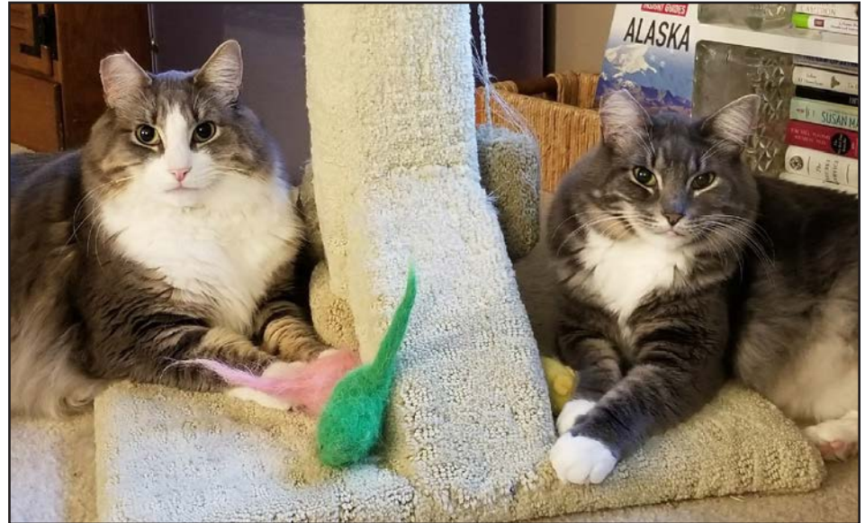
Once abandoned in a condemned house, Harley and Rumble are now living the good life.

"They are smart boys and continue to come to their respective names only. They also know the words "treats", "food in your tummies", "upstairs", "downstairs", "toys", "snuggles" and "kisses". Having been home the past 5 months, they got in a rhythm of meals and about 11:15 each day they seek me out and Harley meeps or chirps and Rumble barks orders at me that it's time for lunch!!! Same with about 5:00 p.m. for dinner. It all starts the same... a tentative peek around the corner by one, rapidly followed by the other, then the full on verbal announcements of my priorities. The