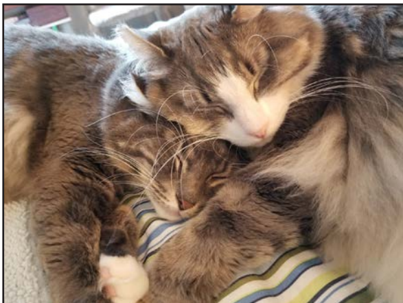
Brothers Rumble and Harley in their new home.

Delta and Bravo were among more than a dozen cats who were abandoned in 2015 in a run-down home and left to fend for themselves. A kind cat lover heard about the kitties from neighbors and stepped in to help. The cats were undersocialized and understandably traumatized by their ordeal. One-by-one, though, she trapped the entire group and contacted Purrfect Pals for help.