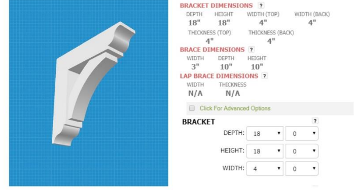
design your own with our online builders

Corbels, braces, brackets, outlookers, gable brackets and gable pediments, rafter tails, gable vents, arch and flat trim, decorative running trim, ceiling medallions, panels, moulding, columns, pilasters, pediments, shutters, and more. We also specialize in custom orders for hard-to-find products.