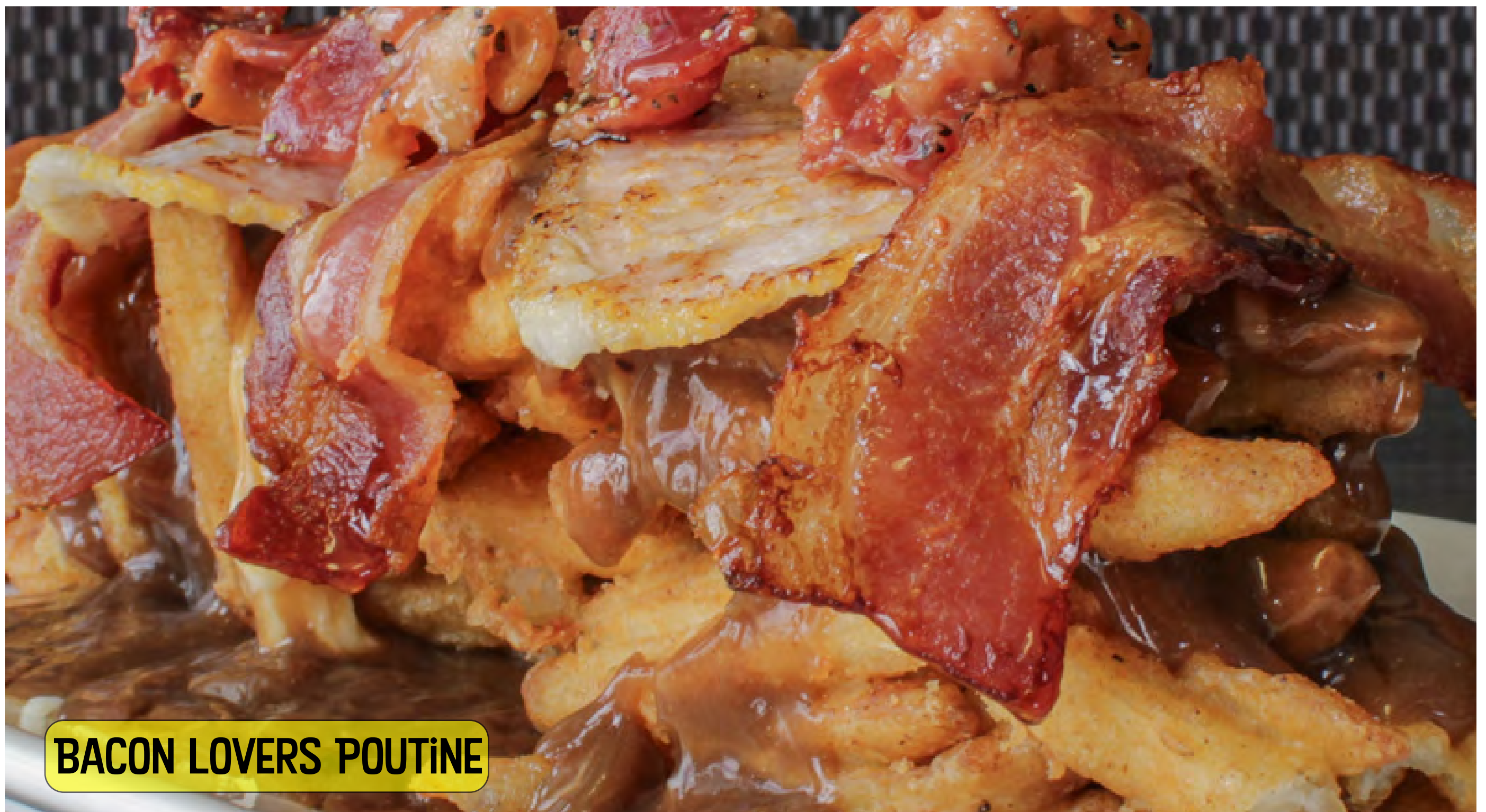
BACON LOVERS POUTINE

Roasted chicken, cranberry sauce, home made stuffing, chives.