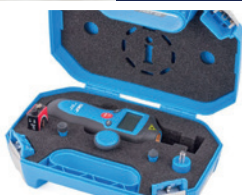
Maintenance Products & Power Transmission