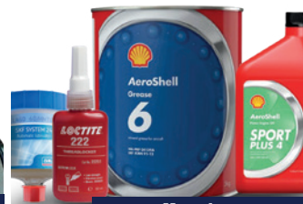
Adhesives & Lubricants