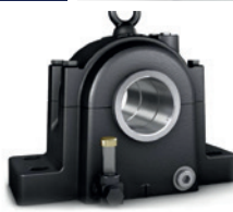
Housings & Inserts