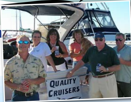
Enjoying "docktails", a not unusual event, with some members of the club.

Soon everyone's on the dock talking about where to go to have our first Margarita. This trip you don't want to miss!