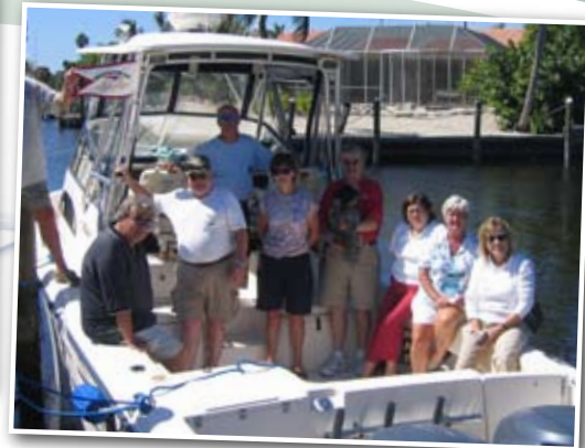
Island hopping on Captiva and Sanibel. A most enjoyable trip.