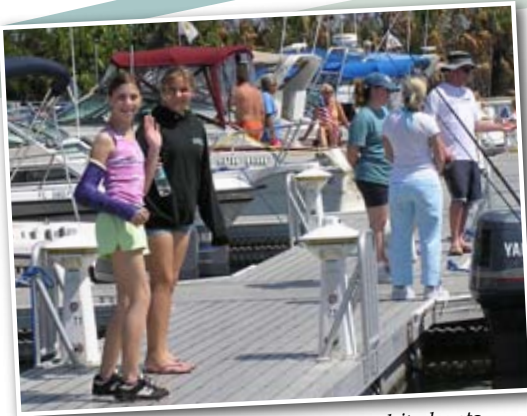
Caladesi packed with Grady-White boats and fun for all ages.