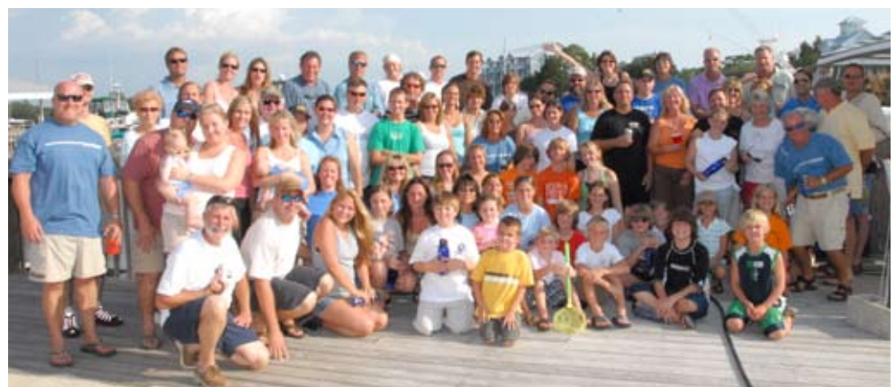
Members of the Grady-White Club on their Steinhatchi outing.