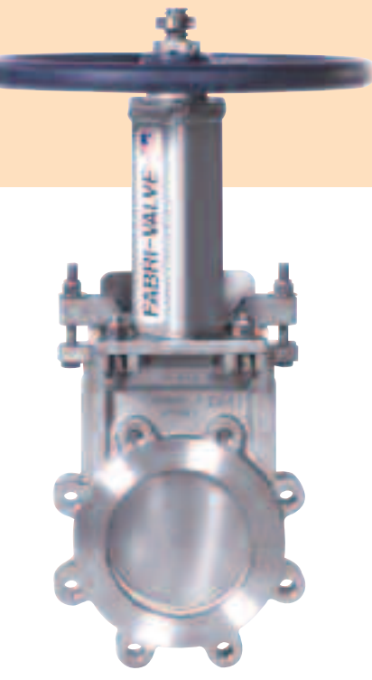
Fabri-Valve C67 Knife Gate Valve