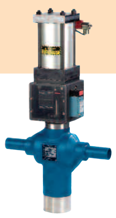
Skotch T4150C gas burner/igniter valve