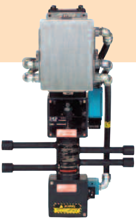
Skotch T506 oil burner/igniter valve