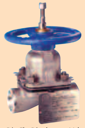
Dia-Flo Diaphragm Valves

The Cam-Tite ball valve is available in various materials of construction, internal trims, end connections, and pressure ratings of up to ANSI class 600 lb, depending on size required.