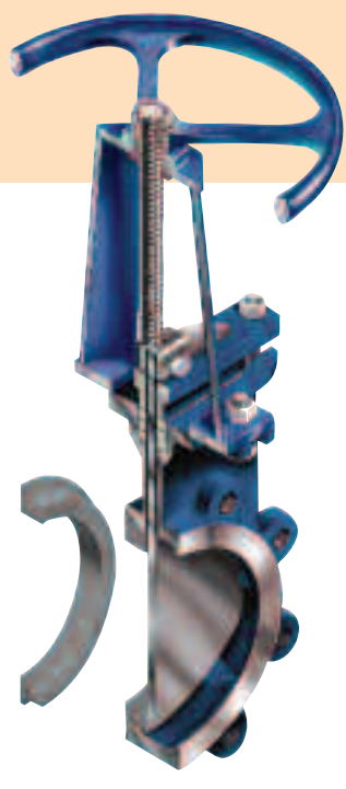
Fabri-Valve C45 Knife Gate Valve with replaceable seat