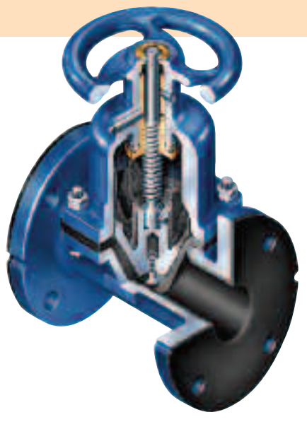
Dia-Flo Rubber Lined Valve