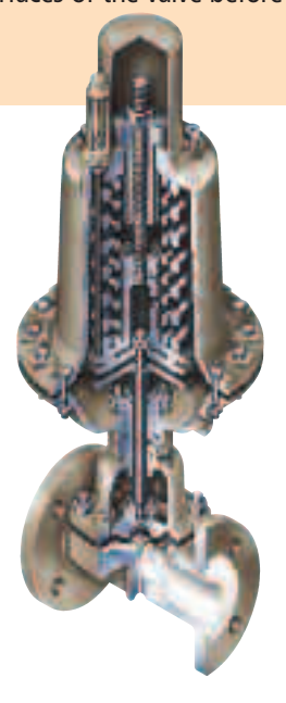
Dia-Flo 2529 with fail closed actuator and PVDF coating Tefzel® is a registered trademark of Dupont

Diaphragm valves are automated with either doubleacting or spring-opposed pneumatic diaphragm type actuators. The actuators are generally specified with adjustable opening stop (rate-set) and open/closed limit switches for remote position indications. Two types of external corrosion protection are available: White epoxy and PVDF coating. These coatings are applied to exterior and interior surfaces of the valve before assembly.