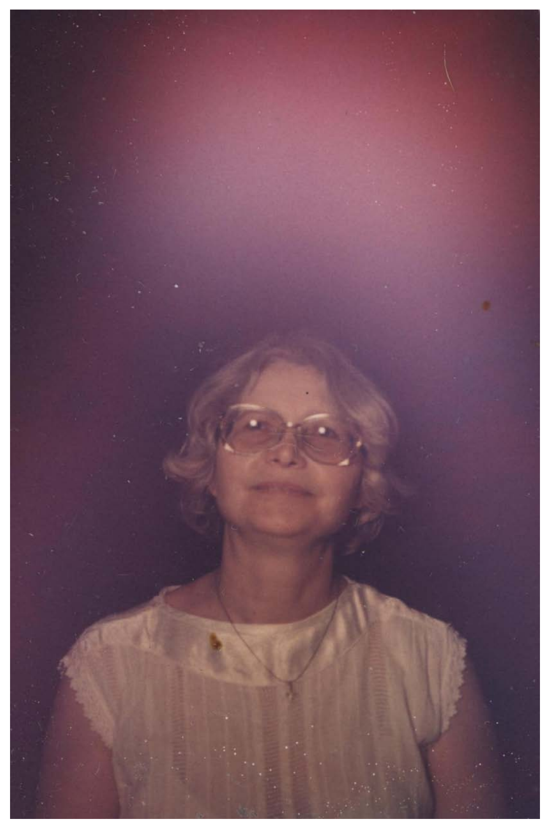
Fig. 2: Kirlian photography of Spiritual level 9 (the author in 1991).