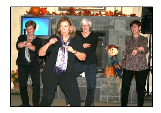
VSR Dancing girls