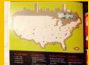
Berklee City Music Network Sites - we have a star!