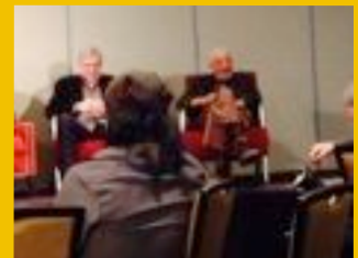
Bobby Colomby (Original Blood, Sweat & Tears drummer) and Bill Withers ("Lean On Me")