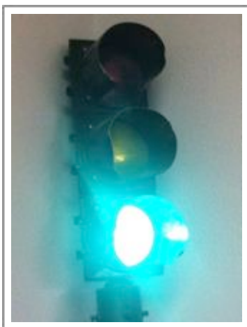
The stoplight is Green - it's time for lessons at the new City Voices Studios at 3009 Merle Hay Road, Suite 5.