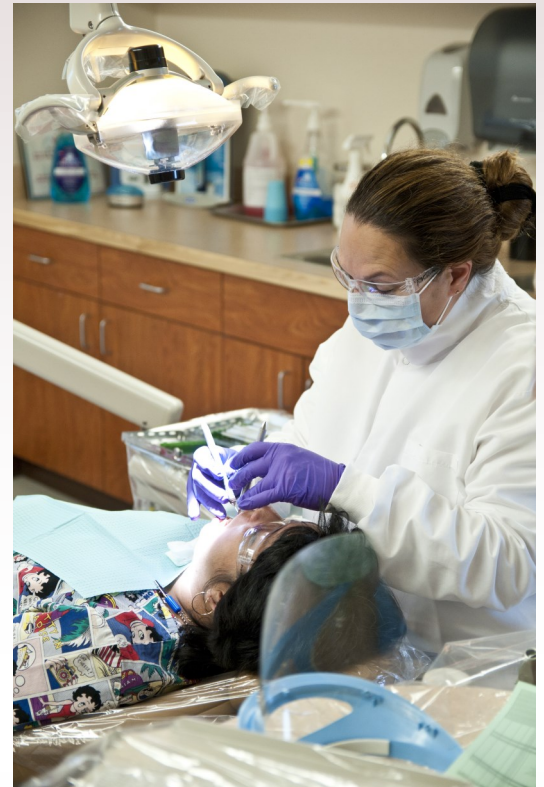
Salud dental employee providing care for a patient.