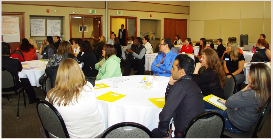
Participants listen to their peers share best practices during the Sept. 29, 2014, O&E Summit in Golden, Colo.

Guests from the Colorado Consumer Health Initiative and the Centers for Medicare & Medicaid Services presented on the value of health insurance and how to help patients and community members use their coverage effectively once it is attained. Experts from the Medicare program, the Colorado Program Eligibility and Application Kit (PEAK) Outreach Initiative, and C4HCO provided in-depth information to participants on complex eligibility rules for coverage programs and application systems.