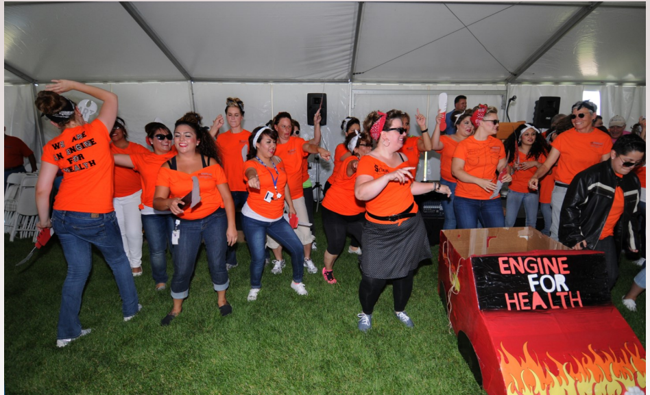
Salud staff members from the Brighton clinic competed in the t-shirt decorating contest and showed off their best dance moves at Salud's annual Staff Appreciation Day on Aug. 15, 2014.