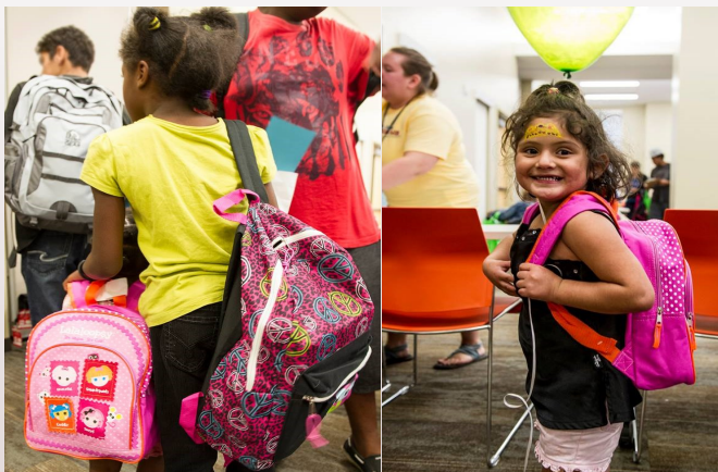
Children receiving backpacks during the Coalition's Back-to-School Healthy Kids Fair on Aug. 16, 2014.

With summer approaching its end, children and their parents took advantage of summer health advice and services, and prepared for the coming year. The Colorado Coalition for the Homeless (Coalition) hosted its annual Back-to-School Healthy Kids Fair in Denver, helping children living in shelters or transitional housing get a healthy start on school. The Coalition provided free health screenings, immunizations, dental care, hearing and eye exams, health education, and backpacks filled with school supplies.