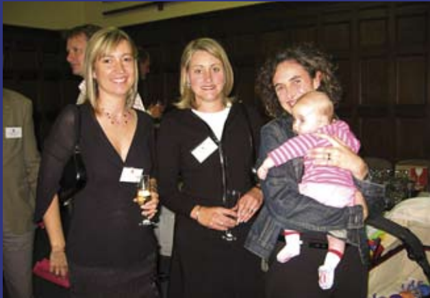
Babes in arms at the 1986-90 Reunion.

Two very happy occasions were held in the Junior Common Room in March and April this year with the 1986-90 Reunion and the 1996-2000 Reunion. At the former event we actually had some babes in arms or young mothers or fathers who had taken a night off from their parenting duties to catch up with old friends and revisit the College.