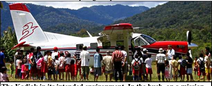
The Kodiak in its intended environment. In the bush, on a mission.

The company Quest Aircraft LLC was founded in 1998. Six years later the first preproduction prototype Kodiak 100 made it's maiden flight on October 16. Another three years later, on March 16 2007 the first production aircraft took off. Just 2<sup>1</sup>/<sub>2</sub> months later the type received FAA certification. The certification includes single pilot operation for VFR/IFR and day/night operations.