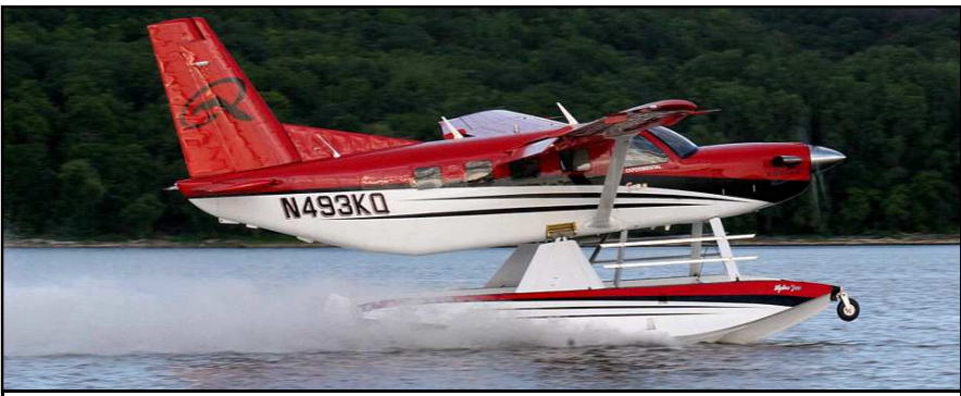
The Kodiak taking off on Wipline 7000 amphibious floats.

The Mission Aviation Fellowship states that it is very satisfied with how the Kodiak works, and that it plans to replace many of its Cessna 206 aircraft with Kodiaks.<sup>11</sup>