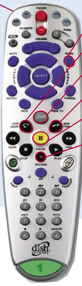
IR Remote Control (Control 1) -

The IR remote has a non-removable green key labeled "1" that controls one TV.