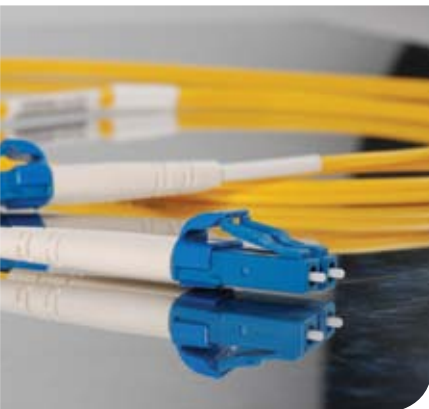
Value Series Fiber Solutions